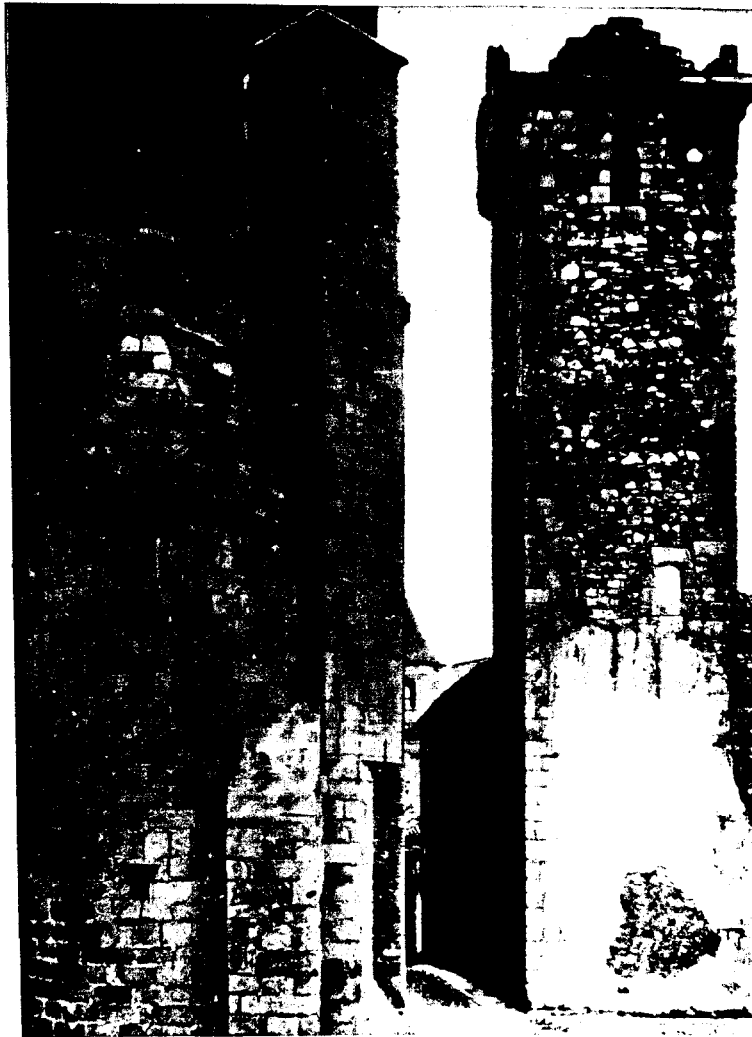
CÁCERES : Torre de las Cigüeñas.