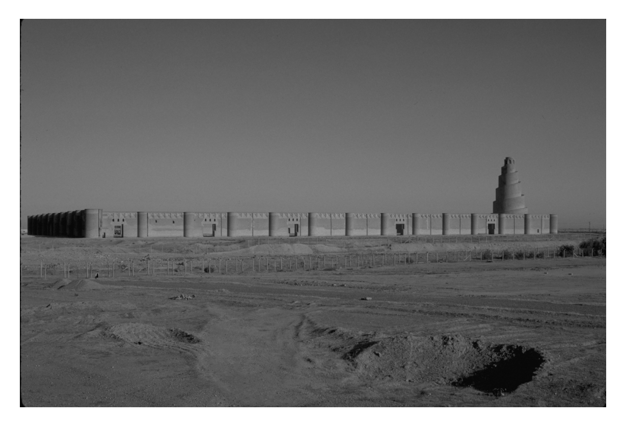
Great Mosque and its Spiral Minaret