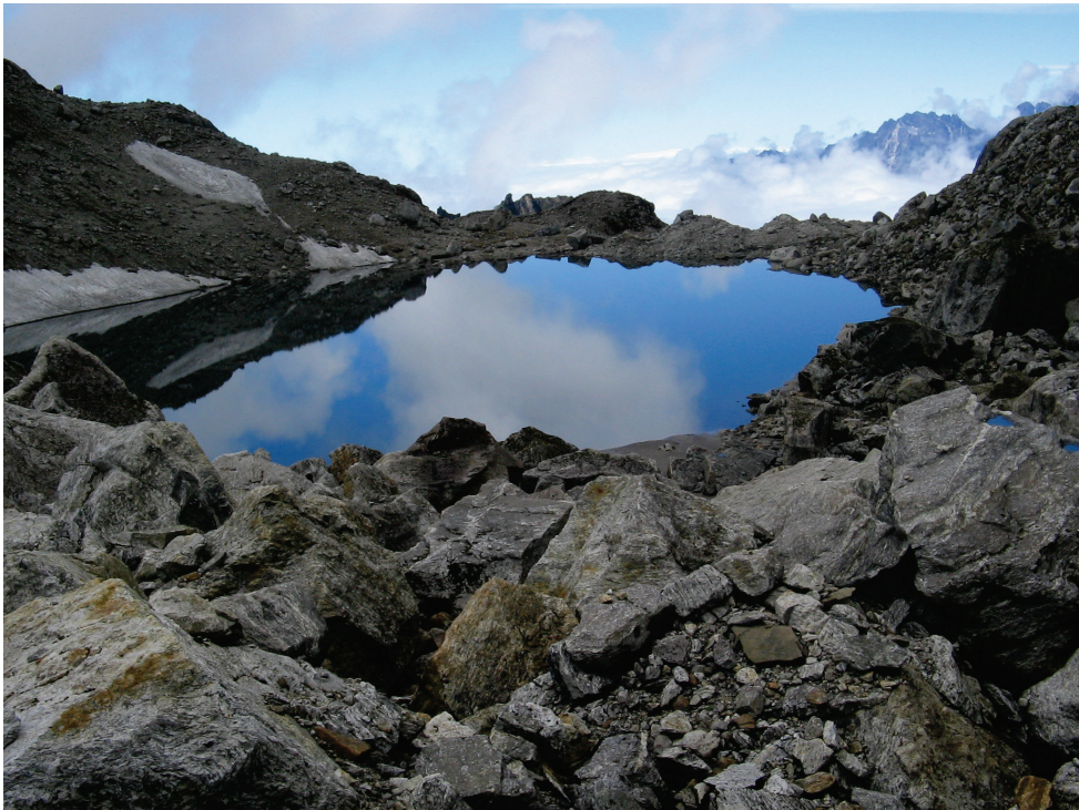
One of the high altitude lake in Khangchendzonga National Park