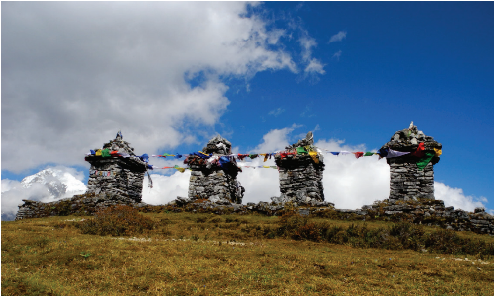
The chortens of Du Tsen Lu Sum