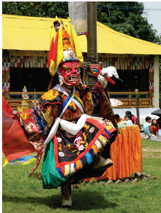
Sikkim's chief guardian deity during Pang Lhabsol at Pemayangtse monastery