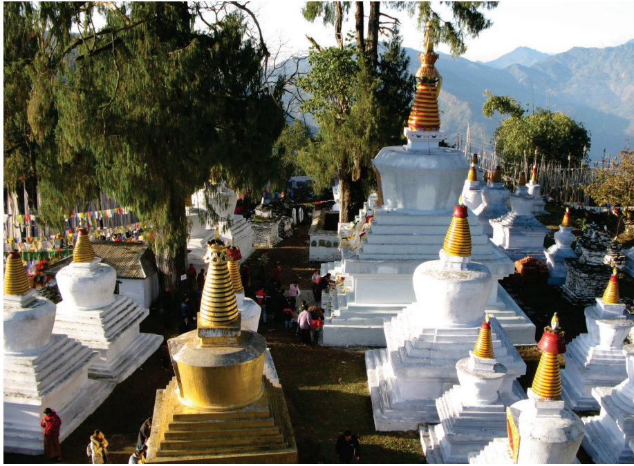
The chortens of Tashiding