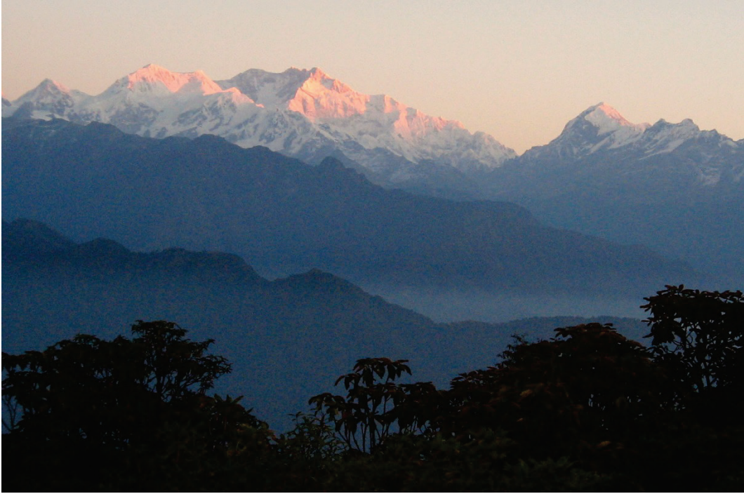
Khangchendzonga seen from Khangchendzonga National Park