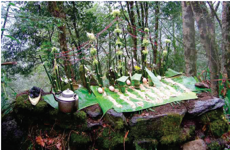
The permanent Lepcha open air altar of Kusung-Lingko (Tingvong)