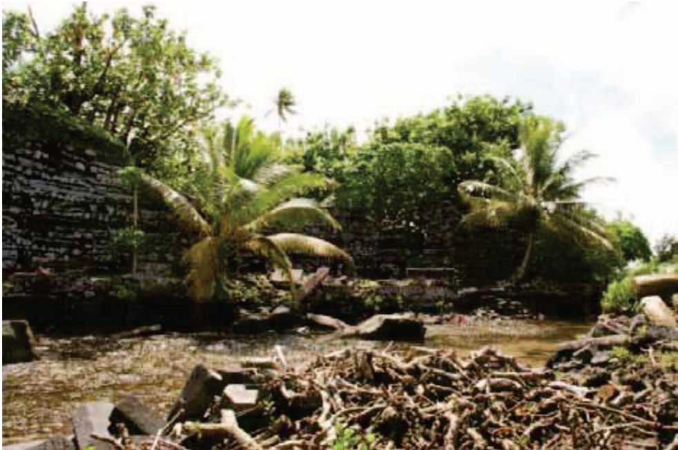
Dense crop trees planted, Nandowas Islet