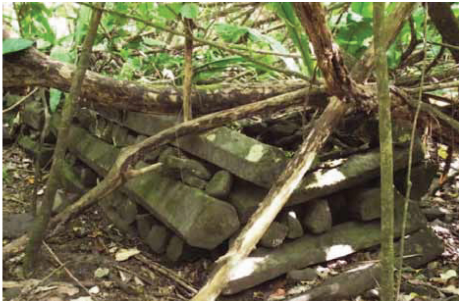
Withered trees on a structure made stacked basalt columns, Pahnkedira