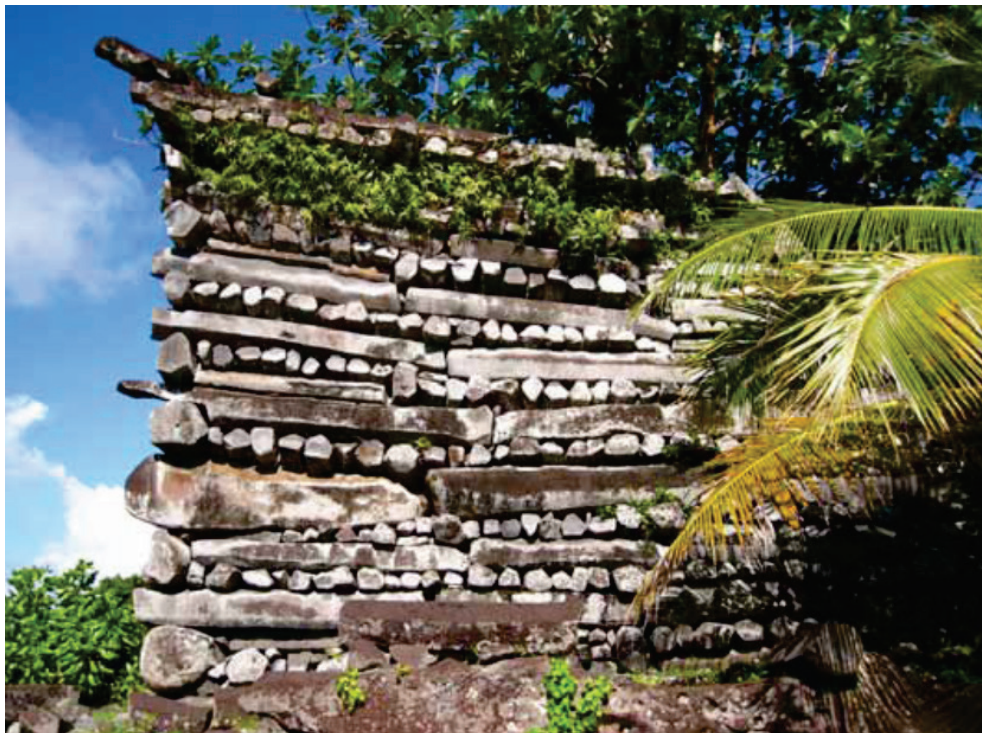
Columnar basalt built by in a header-stretcher technique, Nandowas Islet