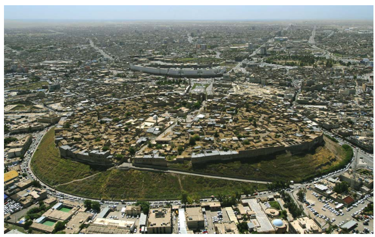
Aerial view of the Citadel