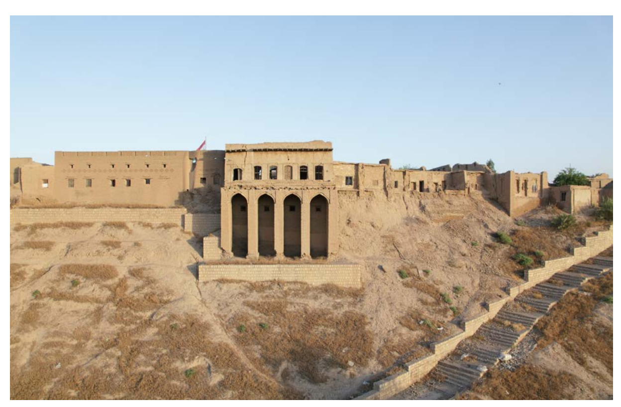
The Citadel, mound and south-eastern perimeter