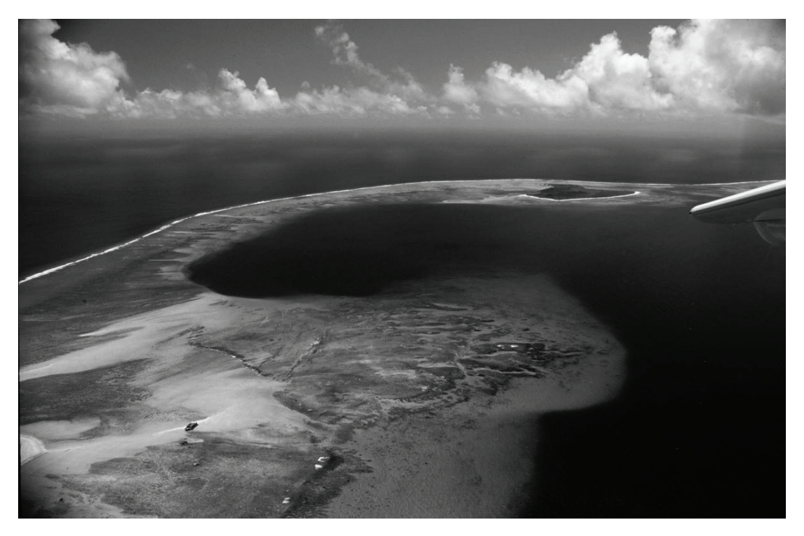
Aerial view of the Bravo crater