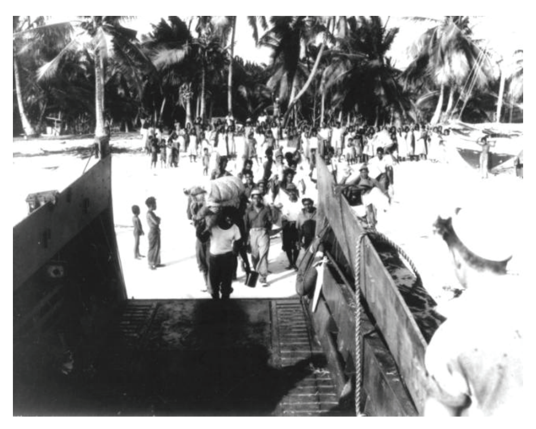
Evacuation of the inhabitants of Bikini in 1946