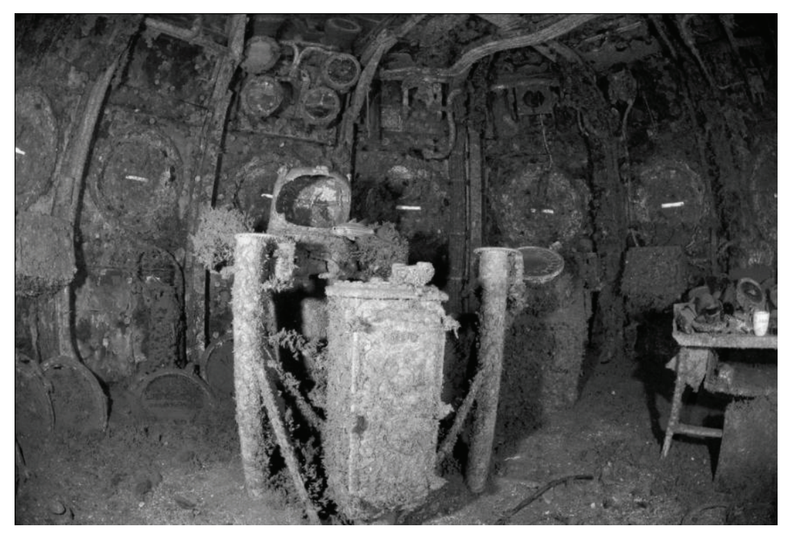
Sunken remains of the aircraft carrier Saratoga