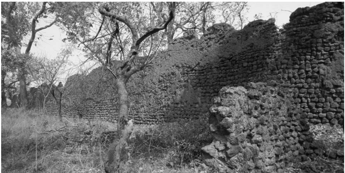
View of the ramparts from the inside