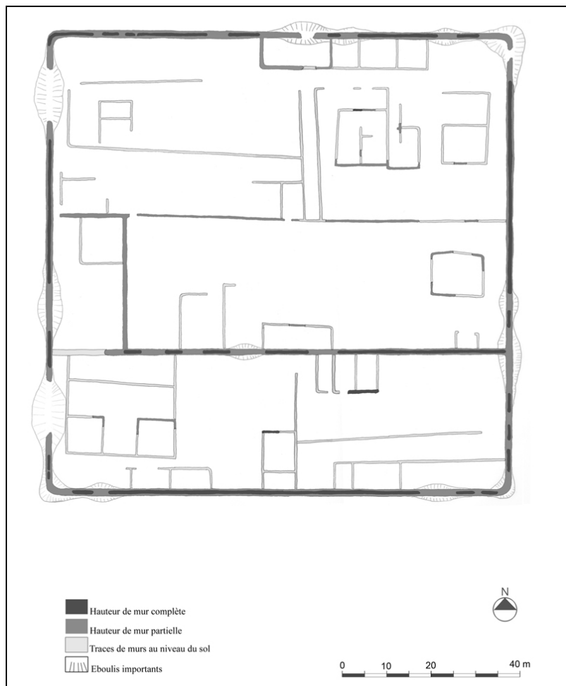
Map of the Ruins of Loropéni