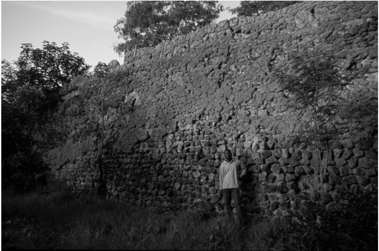
Western rampart seen from the outside