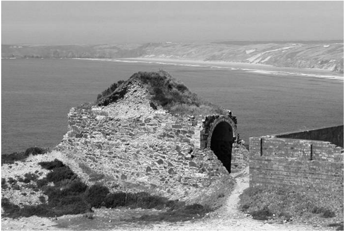
British and Colonial Explosives Company works