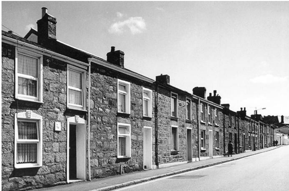
Union Street, Camborne