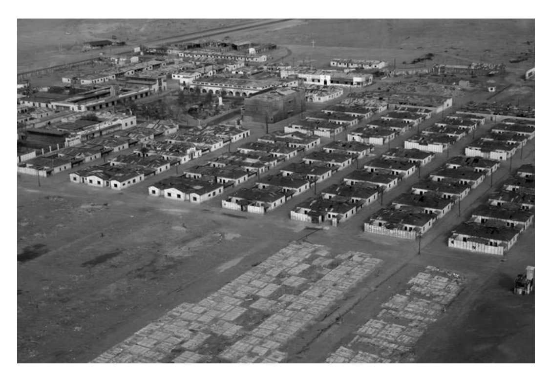
Aerial view of the living quarters of the Humberstone Saltpeter Works