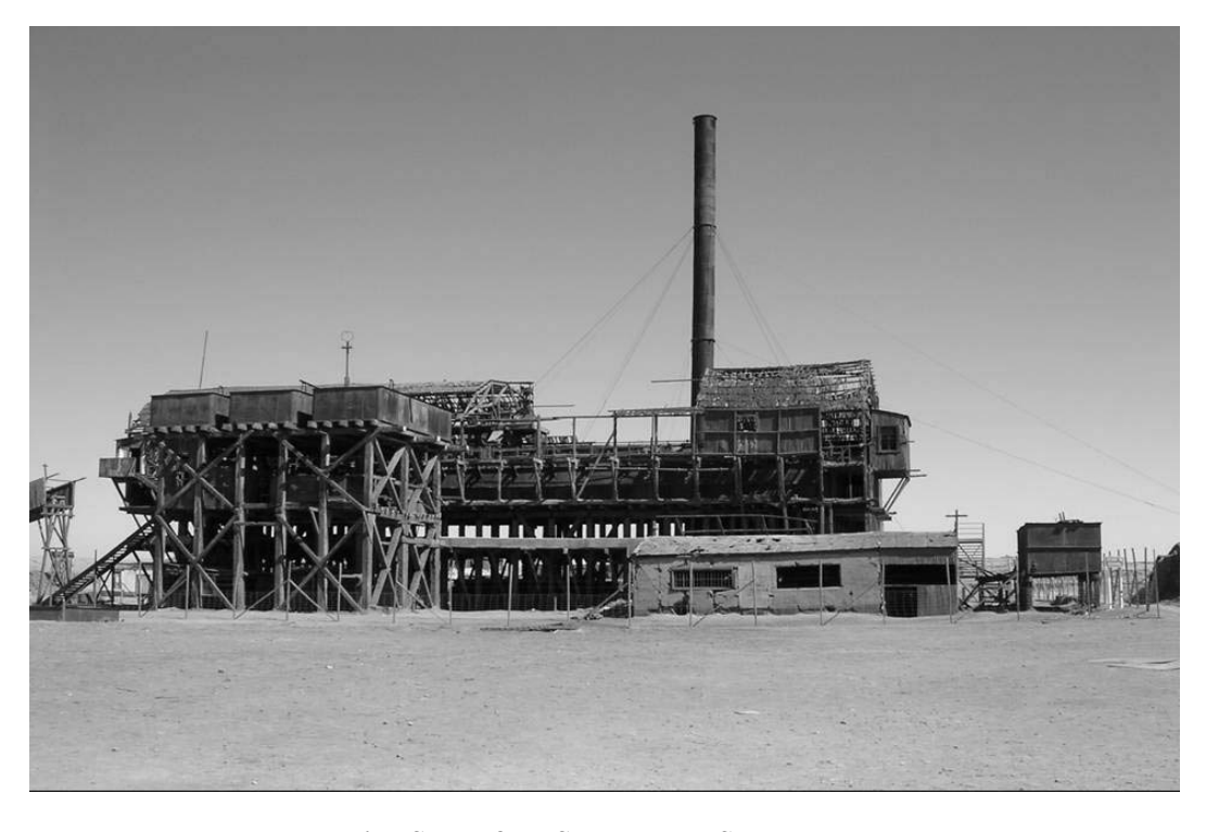
Leaching Shed of the Santa Laura Saltpeter Works