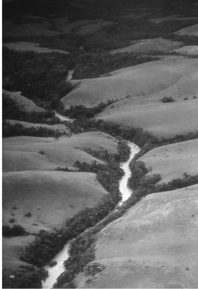
Savannah areas bordering the River Ogooue