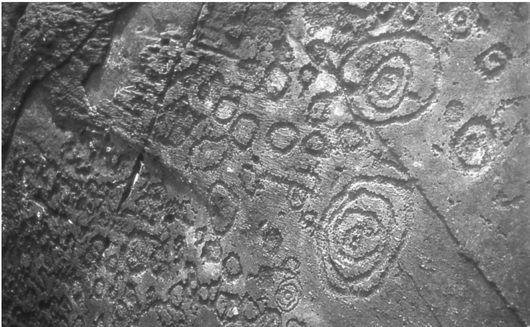
Petroglyphs at Kongo Boumba site