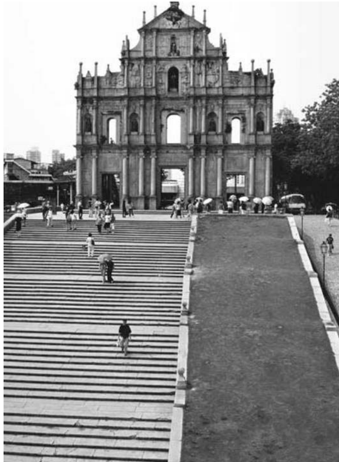
Saint Paul's Ruins