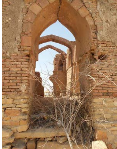
Figure 18. Right. Monitoring the movement of the Jamia Masjid is crucial to the protection of its extant internal arches. Monitoring may help signal changes in the subsoil or structure that may hasten collapse. Emergency stabilization of the arches should be considered, though this requires additional study and careful implementation.