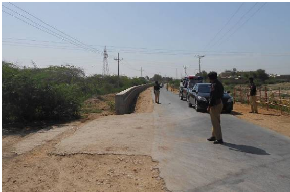
Figure 1. End of partial boundary wall built. Notice the wall stops at a partially paved path that provides access to the buffer zone. According to Government of Sindh staff, the wall sits on the outside of the buffer zone in an effort to arrest encroachment that has occurred on the west side of the site.

Maps were provided to the Joint Mission that indicate a clearly surveyed and defined boundary and buffer zone, as was requested in the 2012 RMM report. A new wall meant to define the buffer zone and prevent encroachment along the west side of the site was only half completed by the time of the Joint Mission visit (see Figure 1). According to Archaeology Director Qasim Ali Qasim, all funds are exhausted for the current fiscal year, so the completion of the wall will not be possible until next fiscal year. A number of large government offices and warehouses are sited within the buffer zone on the inside of the recently built wall. The Government of Sindh should consider the best options for the future of structures within the buffer zone and develop a five-year plan for phasing out or diminishing current use and relocating necessary activities outside of the buffer zone.