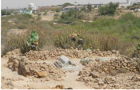
Figure 6. Left. A recent burial site adjacent to the oldest Samma era structures at the site with rubble wall enclosure.