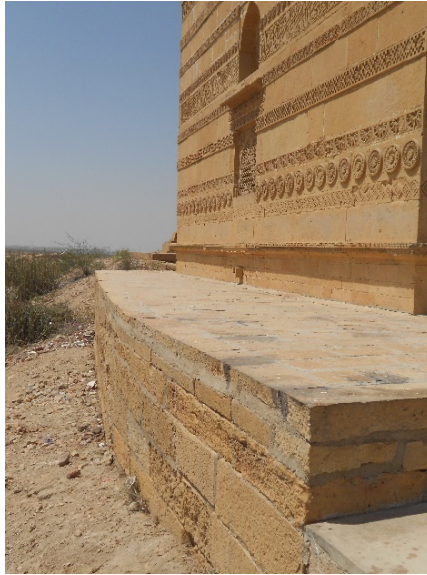
Figure 16. Center. The retaining wall on the east side of the tomb of Jam Nizzamuddin was constructed in the 1990s in an effort to stabilize the structure suffering from differential settlement due to the erosion of subsoil. Although this structure is often cited as the most significant at Makli and the Government of Sindh expresses great concern over its structural stability, there has been no effort to monitor the building or stabilize it since this intervention.