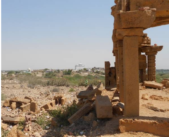
Figure 22. Left. Intricately carved stone elements from the Khanqah of Shaikh Hamad Jamali lie on the ground where they have fallen undocumented and uninventoried. These elements are both structural and decorative and representative of the artistry of the Samma period, as well as key attributes of the OUV of the site. Although proper protection through removal to a controlled storage facility could help to preserve their condition, they remain exposed to the elements that irreparably damage them through erosion and abrasion. Without adequate documentation, the technological and aesthetic value of these elements is forever lost.