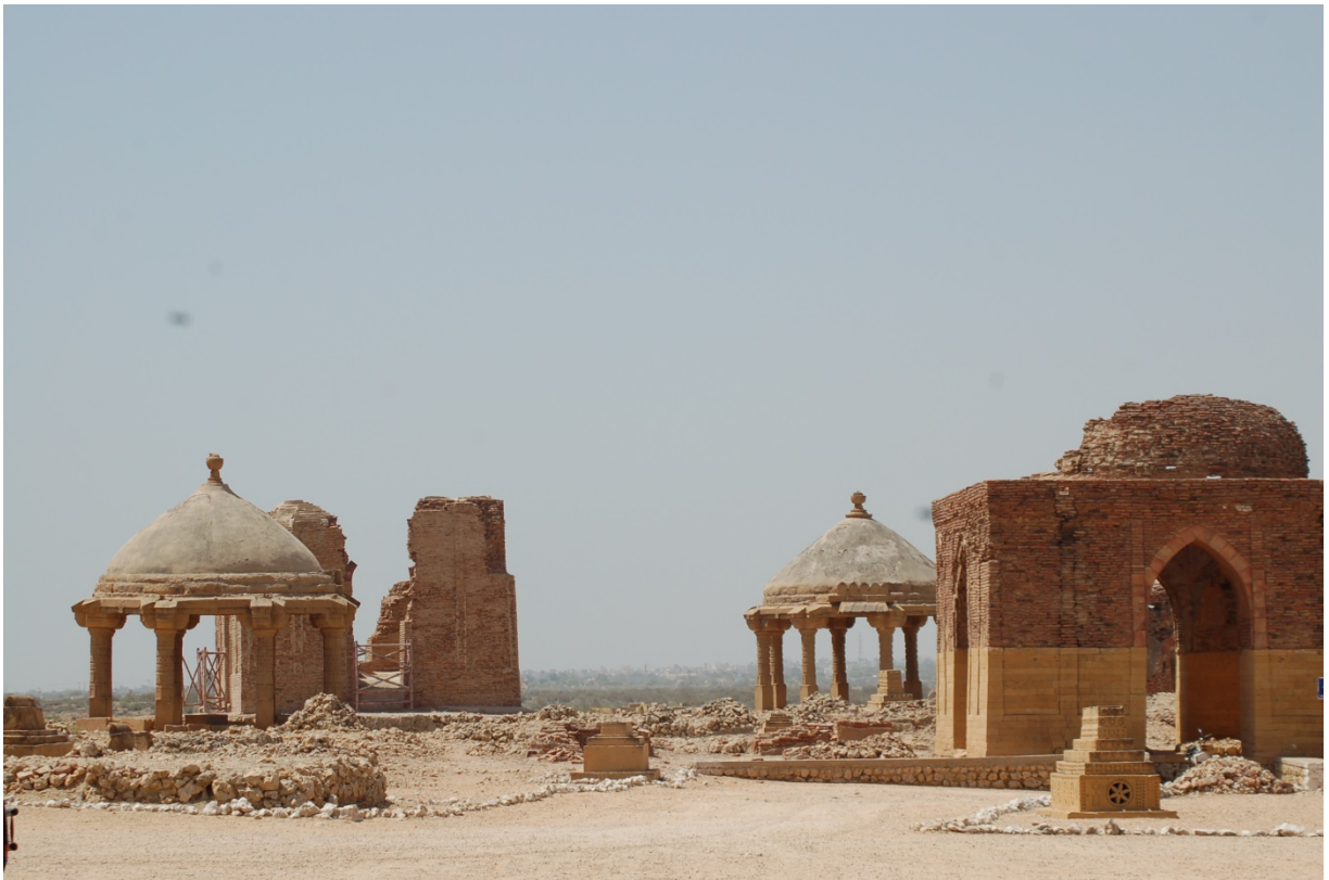
A view from the North at the monuments of Samma period