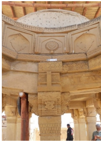
Figure 18. Left. Use of tell-tales was observed only on the tomb of Jan Baba, currently undergoing research and monitoring by a third party NGO. Note the temporary shelter above providing protection from precipitation. This practice should be implemented at other monuments, particularly those with weathered stone or exposed gypsum (gach) plasterwork that is highly susceptible to damage by water.