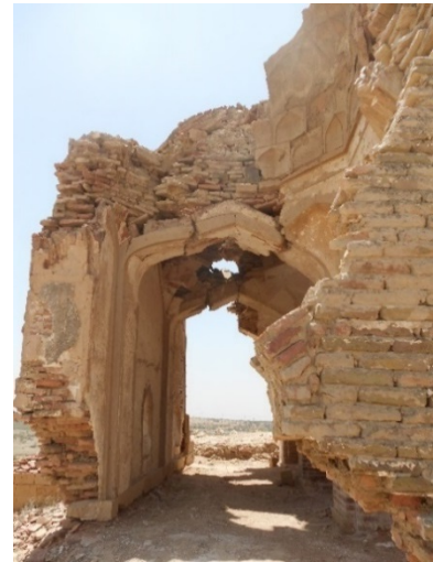
Figure 21. Right. Despite examples of imminent collapse, like the fragile arches and partial dome with plaster of Lali Masjid, there is no ongoing effort to carry out emergency stabilization of structural components or surface decoration on any monuments at the site.