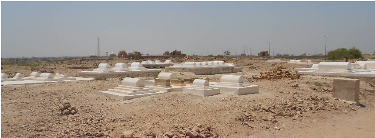
Figure 24. Recently reconstructed and replastered gravesites adjacent to the tomb of Sultan Ibrahim. The reconstruction approach is questionable without adequate documentation of the graves and careful recording of the process and distinguishing of historic fabric and new intervention material. The use of stark white lime wash without addition of aesthetic color tempering to ensure the work is visually compatible with the character of the site is inappropriate. Additionally, if information about these graves and their owners was known, there is no interpretation provided. The allocation of resources to this work is highly questionable given the state of conservation of many far more significant structures within the site of Makli.