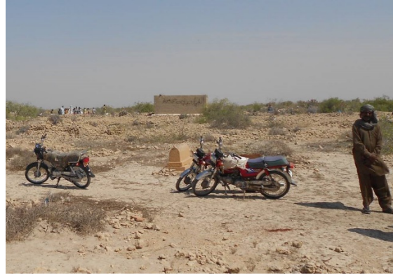
Figure 3. Ongoing burial and funeral with group of participants in the background next to structure with graffiti. In the foreground, parked motorbikes used by funeral participants.