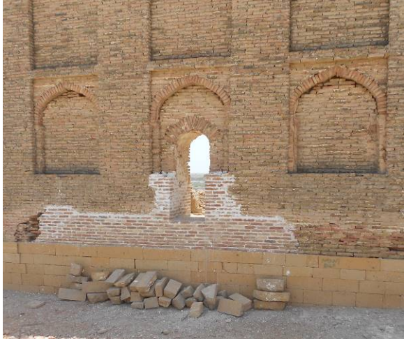
Figure 25. Left. Recent masonry infill carried out in Lali Masjid highlights the inappropriate use of visually incompatible materials, like bright red bricks and pure lime. No materials analysis has been conducted to determine the physical and chemical characteristics of the original fabric and inform the fabrication of intervention materials to ensure compatibility.