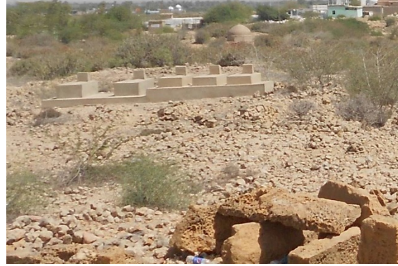
Figure 7. Right. Recently constructed tombs located adjacent to the oldest Samma era structures at the northern end of the site. The deteriorated stones in the foreground are fallen from the Samma period Khanqah Shaikh Hamad Jamali.