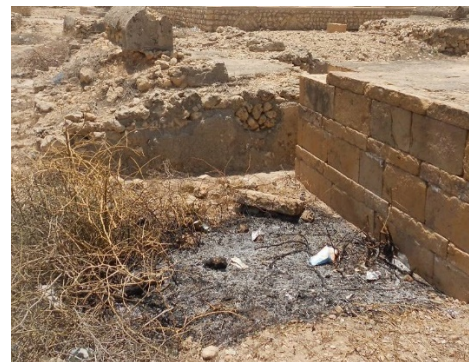
Figure 5. Right. Evidence of a recent fire burned adjacent to the plinth of an historic gravesite. The small area affected suggests this was a controlled fire purposely lit by someone on the site. This activity surprised the Sindh Government staff accompanying the Joint Mission.