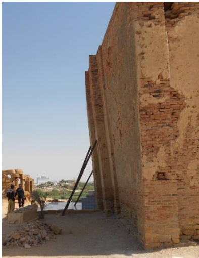
Figure 22. Left. Steel I-beam Props placed at Jamia Masjid date from the 1970s. Since then, no structural interventions have been carried out though anecdotal evidence suggests continued movement. The lack of crack monitoring has made it impossible to determine if movement continues and at what rate.

Sindh Government staff were often aware of the challenge, but appeared incapable or unwilling to take precautionary measures. However, earlier shoring and other types of emergency stabilization is present on the site dating from the 70s (Jamia Masjid), 80s (Isa Khan Tarkhan), and 90s (Jam Nizamuddin) with no subsequent efforts to prevent movement or collapse in those or other buildings (see Figs. 22-24). The lack of monitoring (see Condition Monitoring) contributes to poor understanding of conditions and/or effectiveness of existing shoring, etc. Additionally, there appears to be no clear prioritization of monuments on the site either in terms of significance or condition.