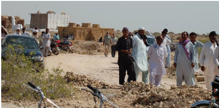
Figure 4. Left. Participants at a burial adjacent to historic structures. Note the motorbikes and cars in the area and the number of people involved. This event was a surprise to the Sindh Government staff accompanying the Joint Mission.