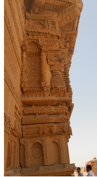
Figure 17. Right. Intricately carved balcony and decorative element showing signs of detachment from the rest of the structure. This requires regular monitoring and may benefit from temporary stabilization as well as protection from the elements.