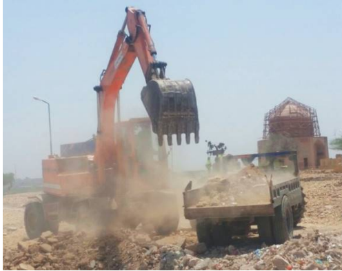
Figure 2. Image of illegal dumping that appears in Dawn on April 21. Note scaffolded tomb of Sultan Ibrahim in the background