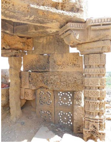
Figure 19. Left. The extreme weathering of the Khanqah Shaikh Hamad Jamali requires photographic and weather monitoring to determine the rate of change and understand the mechanisms of deterioration to inform the design of effective protective measures. A weather station should be installed in the vicinity to collect wind velocity and precipitation data.