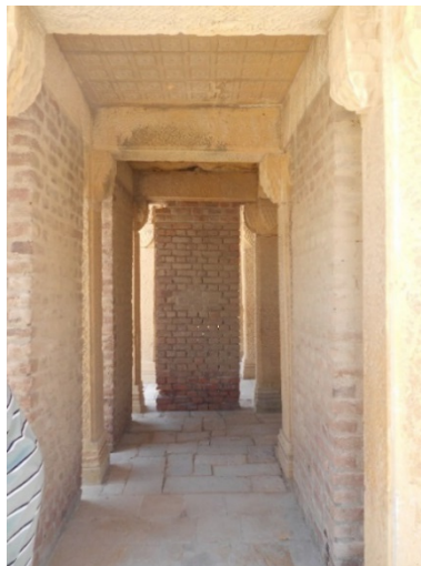
Figure 20. Right. Brick masonry pillars constructed during the 1980s at Isa Khan Tarkhan to support the upper floor while replacement stone pillars were constructed. Apparently, the replacement structural members have been installed and the temporary shoring is no longer necessary, but it has never been removed.