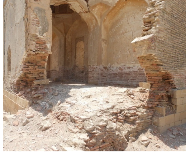
Figure 26. Right. Additional infill is visible in the building interior. However, the fragile exterior walls in the foreground have not been stabilized and continue to crumble and lose original fabric. It is hard to imagine why stabilization was not carried out in these areas, which would have greatly contributed to the structural stability as well as arrested continued loss of historic masonry and adjacent plasterwork. Note the large amount of engraved graffiti present on the historic plaster.