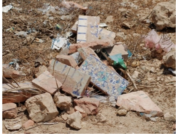
Figure 23. Right. Intact decorative tiles lie amidst masonry fragments and trash on site. The loss of these significant glazed elements represents the ongoing loss of site integrity and diminution of its OUV, which is linked in part to the refined artistry and aesthetic of the monuments that integrate central Asian-style decorative tiles.