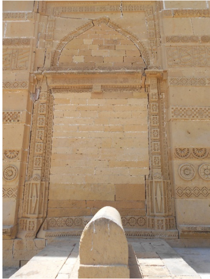
Figure 15. Left. The differential settlement of the tomb of Jam Nizzamuddin requires crack monitoring with tell-tales to determine if movement of the building continues and the rate at which it occurs. Such tools coupled with regular monitoring may signal decohesion of subsoil or other changes that may contribute to calamitous loss of the structural integrity. Note infill pieces in the open cracks that apparently date to the British period.