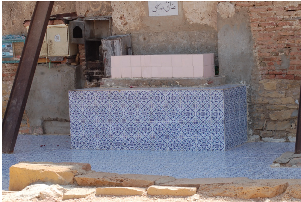
A photo: Tomb of Mai Makli:

nomination dossier mentions about half million of graves within the Makli necropolis and this figure clearly demonstrates that Makli has long been a holy place where people not only venerated but also wanted to be buried in. Nowadays, the site still remains a living heritage site where rituals and rites are performed according to the region's old customs. A great number of pilgrims arrive every day at Makli for various purposes such as offering veneration and seeking advice from their favourites saints buried at Makli, but also to bury their relatives who wished to be laid to rest near their favourite saints. Consequently, this living heritage value, although it is not included within the OUV of the property, should be taken into account in the management of the property.