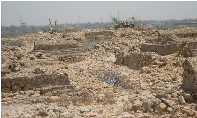
Figure 8. Neglected gravesites littered with trash and debris that reflect the general condition of the site.

The site is liberally littered with trash of all types and it appears that there is little concerted effort to remove trash (see Figure 8). This appears to be the result of little concerted effort to keep the site tidy as well as few trash receptacles present on the site. On the whole, the site appears unkempt and neglected, except for the southern main entrance to the site and a few areas adjacent to some of the most famous structures.