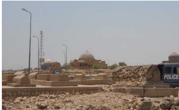
Figure 9. Lighting along the principal road near the southern end of the site and the tombs of Mirza Isa Khan Tarkhan and Shurfa Khan. Recently restored tombs are also visible in contrast to those in need of stabilization and conservation.

There is little infrastructure on the site that provides consistent access and information to visitors. The main access road within the site is only paved for part of the length of the site. Lighting and electricity appear only to be present along this path (see Figure 9). There are no bathrooms or other visitor facilities on the site, except at the entrance. The Master Plan under development proposes locations for certain facilities spread throughout the site.