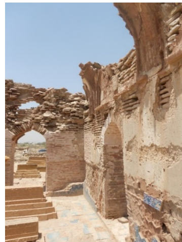
Figure 19. Right. The fragile condition of many buildings with partial arches and domes, loose and falling masonry, exposed plasterwork, and extant glazed tilework call for regular photographic monitoring to document ongoing loss and exacerbated structural weakness. Stepped settlement cracks require monitoring with tell-tales.

Many of the historic structures have elements that are in danger of collapse or that show signs of active settlement that is damaging to the building fabric. When discussing these examples,