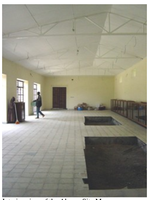
Interior view of the Aksum Site Museum

It is to be noted that UNESCO Addis Ababa has done an evaluation study of the World Bank project in Aksum and Gondar, at the request of the World Bank.