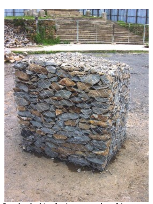
Sample of gabion for the construction of the temporary embankment

A sample of an embankment gabion was completed. Its quality did not seem sufficient; the Supervision was informed of the necessity to orient the Construction Company on improving it