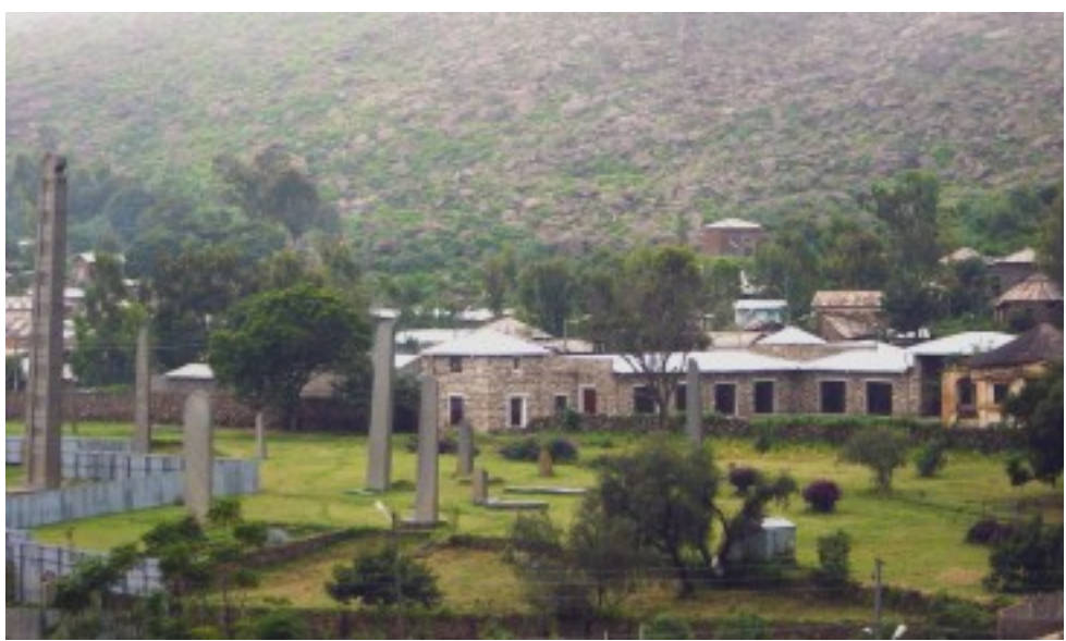
General view of the Aksum site museum (World Bank Project) in relation with the Stelae field

In January 2006, a UNESCO mission visited the work site of the World Bank funded site museum, met with the project members and was shown a model and drawings of the Museum. At that time, reservations were expressed on the choice of the Museum's location immediately at the entrance of the site, and a recommendation to use thatched roofs was made.