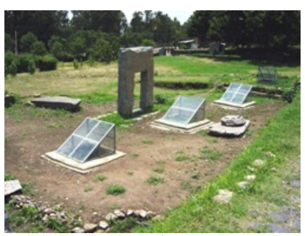
Ventilation/protection elements for the underground galleries (World Bank Project)