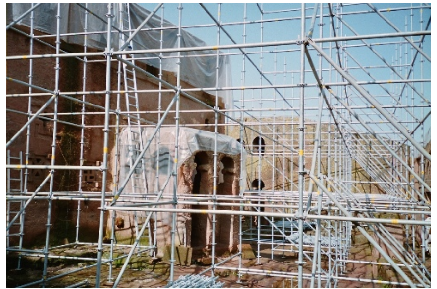
View of the Scaffoldings at Biet Mariam