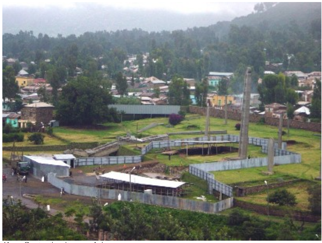
Aksum Construction site: general view

A sample of an embankment gabion was completed. Its quality did not seem sufficient; the Supervision was informed of the necessity to orient the Construction Company on improving it