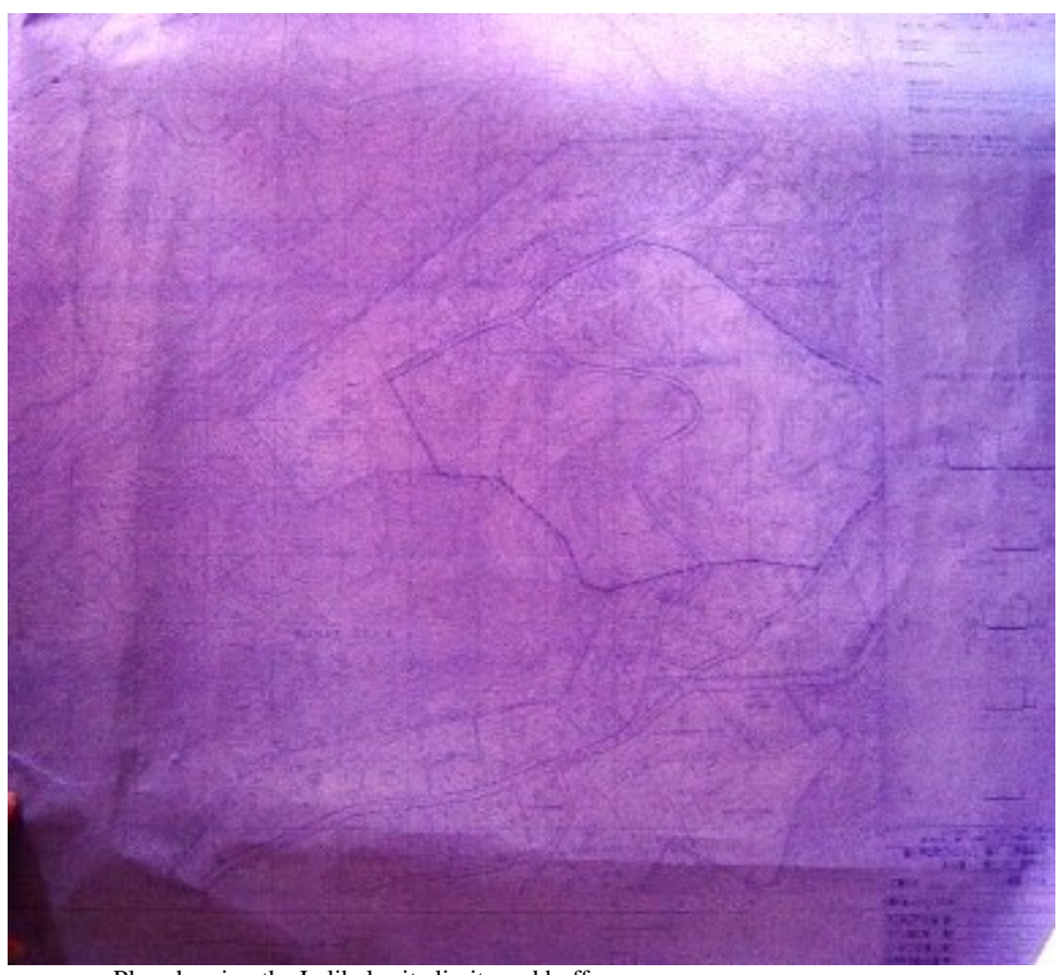
Plan showing the Lalibela site limits and buffer zone