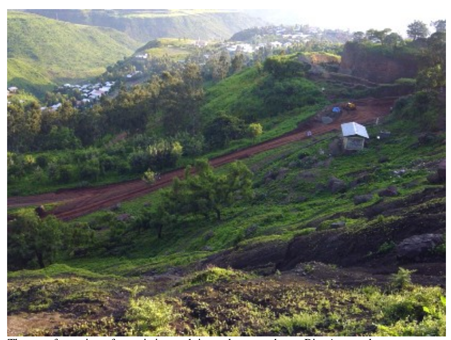
The transformation of an existing path into a large road near Biet Amanuel

These reassurances seem to be enough for now, but a very close monitoring is to be done in order to avoid any risk of dropping heavy elements on the Biet Amanuel on one hand, or changing the landscape and the traffic around the site, on the other.