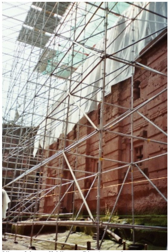
View of the scaffoldings at Biet Amanuel

All the works undertaken so far have been done manually, according to the risk mitigation measures requested by the World Heritage Committee (Vilnius, 2006). Nevertheless, one change is to be noted and closely followed-up: in the vicinity of Biet Amanuel, a road was enlarged to allow the use of a mobile crane.