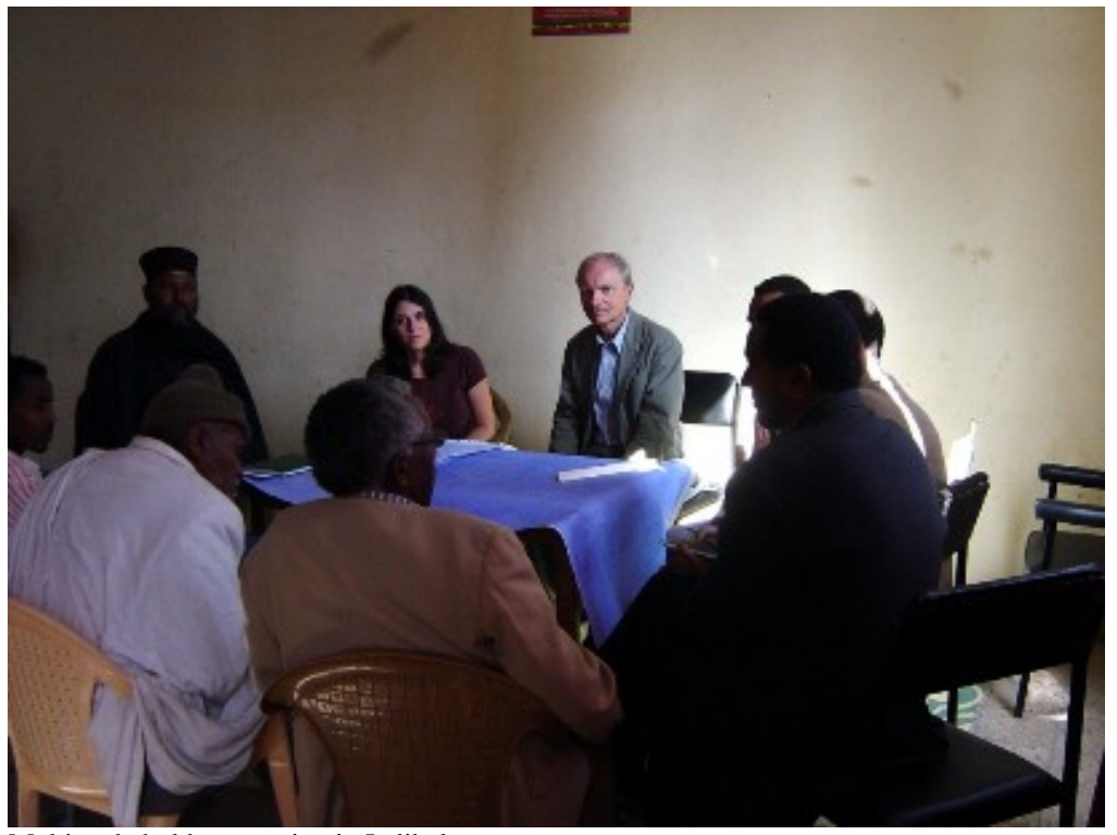
Multi-stakeholders meeting in Lalibela