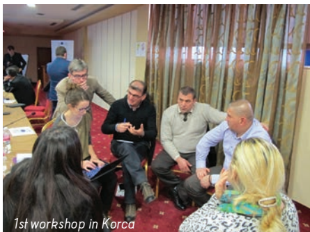
1st workshop in Korca

At the meeting stakeholders presented the state of the cultural and natural heritage in the Lake Ohrid region, with particular focus on the existing management structures and planning processes in two participatory working sessions. Two main participatory working sessions focused on undertaking a thorough stakeholder analysis, the first session with a thematic approach based on the key themes of the project (waste, sustainable tourism, urban development and spatial planning, civil society and communities), while the second involved group work focused on nature and culture. The mixed composition and size of the groups enabled dialogue across the various sectors and an integrated review of stakeholders present in the Lake Ohrid region.