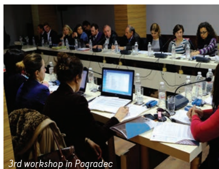
3rd workshop in Pogradec

Representatives from both countries participated in the workshop, including national authorities from the respective ministries of environment and culture, local authorities from the municipalities of the Lake Ohrid region, Advisory Bodies to the World Heritage Committee (ICCROM, ICOMOS and IUCN) as well as a representative from UNESCO.