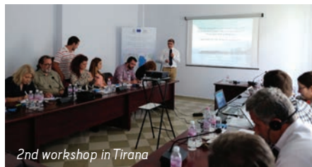
2nd workshop in Tirana

statements led to a single statement, which will be fine-tuned over the course of the management planning process for the World Heritage extension project. The workshop also focused on mapping, improving knowledge of the area and understanding the different factors affecting the area, in particular ongoing and future projects and initiatives that may have an impact on the Lake Ohrid region and the potential transboundary World Heritage property.