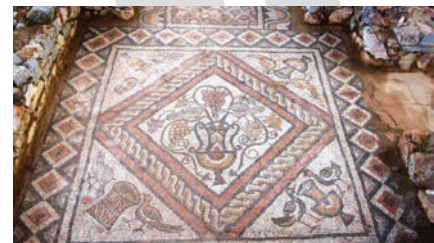
Lin Mosaic, Pogradec

Albanian National Council for Restoration at Ministry of Culture defined the Buffer Zone for protecting cultural heritage in the area of Lin Village Pogradec.