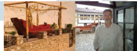
The old Ohrid boat & Goran Patchev

An old Ohrid boat, recently reconstructed, brought back distant memories to the citizens living on the shores of Lake Ohrid.