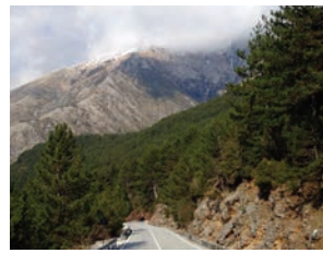
View from a forest in Albania

Pogradec inherits a tradition and obligation to conserve and protect Lake Ohrid. Our citizens have always seen the lake as a valuable resource, and have treated it as a gift from God. A network of local environmental NGO-s was established during 1996-2004, under the Regional Environmental Centre in order to raise public awareness and participation, thus becoming a factor and a partner of the municipality in decision making for the region of Lake Ohrid. We also consider as a necessity the cross-border cooperation. Together with municipalities of Struga and Ohrid we signed a Memorandum of Understanding in Wismar and another on technical cooperation, will be signed in Ohrid. This is the only way to ensure sustainable development of the Lake, inspired by the motto "One lake, one vision, one future"