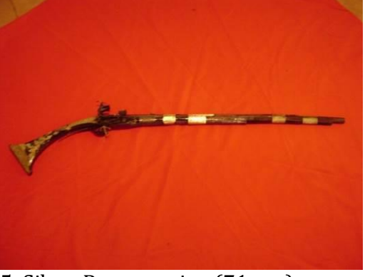
5. Silver Roman coins (71 pcs) Museum of Budva