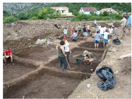
Figure 1.Appearance of square 10 Figure 2. Works in squares 1-9