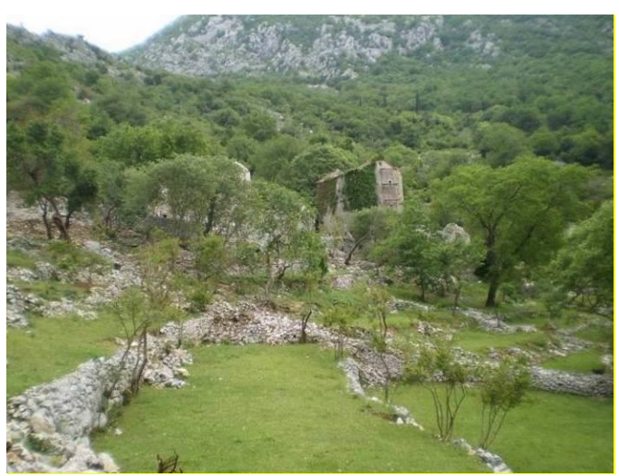
View of the complex in Maala from southwest