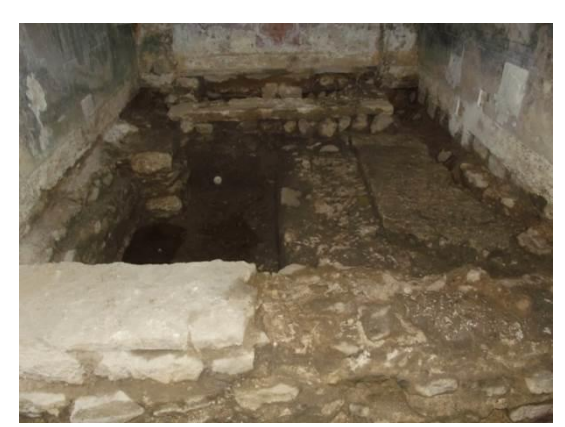
The interior of the church after the last excavations

Archaeological works continued during two campaigns in July and December 2014, when research of nave of the church and its immediate surroundings was continued. Complicated stratigraphic picture of the church and the building beneath it, on the basis of the collected data, we can explain as follows: the oldest building was built probably during the 5th century, which was ruined in late 6th - early 7th century, which is indicated by a layer with fragments of pottery vessels.