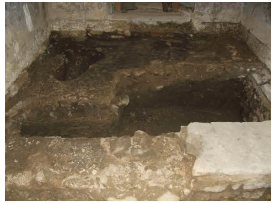
The interior of the church after the last excavations

The building was renovated, most likely during the 7th century, but organization of the rooms was slightly changed. Unfortunately it was not possible to fully explore the building so its dimensions and purpose are unknown, and from such a small excavated segment it is impossible to draw conclusions. The church (chapel) was built above this building in the Middle ages, and it used some of its walls as the foundation (the eastern, northern and at the beginning western), while others (later western and southern) were erected on the remains of a mortar floor. At this stage, the church got the altar stone mensa. From the Middle Ages to the late, i.e. recent times the church had several phases during which it changed its internal organization and appearance. So the church was extended to the west, new altar