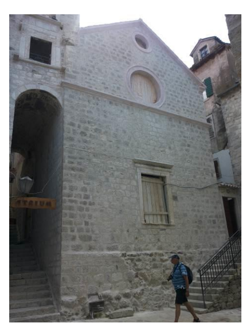
The prison building in the Old Town of Kotor

The Capital Budget for 2014 provided the funds for executing urgent repair works on the roof of the building, preparation of project documentation for rehabilitation of the building and its equipping. Activities were conducted on preparation of the Study for execution of urgent repair works on the roof of the building and collecting documents for implementation of procedures. Given that not all conditions for implementation of procedures were fulfilled, activities were undertaken and implementation of the related procedures was provided by the National Museum of Montenegro. Implementation of the project continued in 2015, and comprehensive surveys and study of the original appearance of the building and its latter remodelling are underway based on which the conservation project will be developed.