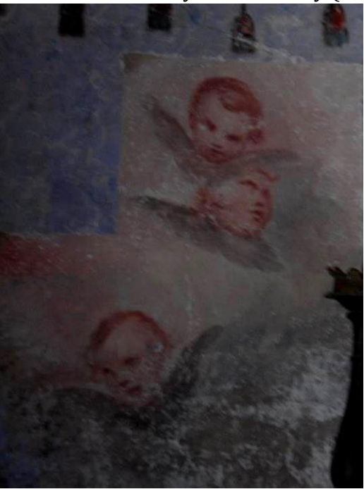
The remains of frescoes of Kokolj

The church of St. Neđelja is located in Kumbor, in an area that has been a part of a military base for decades, which made the church isolated and inaccessible, so the science has not been able to learn more about the secrets hidden in this complex facility. The church suffered great damages during the great earthquake of 1979 and the last damage caused by a lightning strike in 2003 prompted the competent military officers to seek professional assistance from the Regional Institute for the Protection of Monuments of Culture. On this occasion, they performed the first research on this facility. Conservation and art research of the decorated interior revealed an older layer of painting for which, by analogy, it was concluded to be the work Tripo Kokolj and dates from the early 18th century (1704-1709).