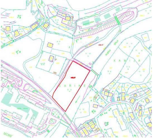
Position of the locality Carine VI/2014

The location of the Sector Carine VI/2014 (N42°31.005' E18°41.614') in Risan is a registered cultural property and is located on a triangular plateau at the foot of the hill Gradina. It is bordered on one side with the sea, to the west, with the small river Spila to the southeast and with slopes of the hill to the north. The space that occupies the location is partly threatened by construction of a hotel and the road towards the sea and construction of a number of individual residential buildings in its immediate vicinity.