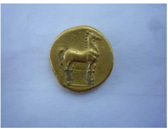
Gold coins of Carthage