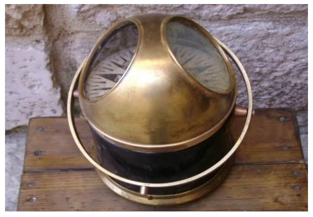
2. Marine Lantern from the ship "Castor" 19 century, inventory no. 298, Museum of Perast

The item was repaired, cleaned of corrosion and put the new glass and protected by inhibitor.