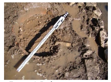
Figure 4. Pythos in situ