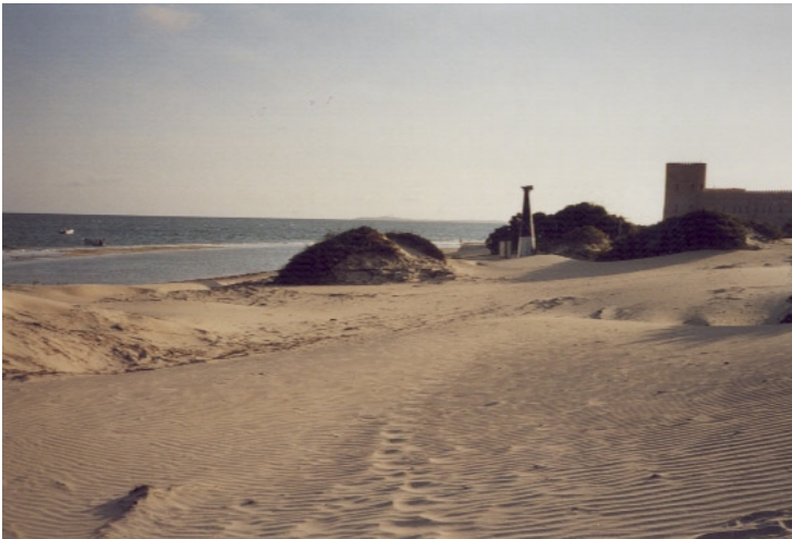
9. Shela beach, at the back is visible the only building that has been erected in the sanddunes, before the inscription of Lamu Old Town as a World Heritage site