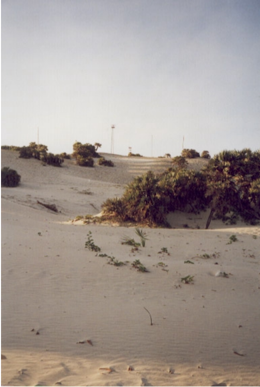
10. Shela sanddunes: at the back are the antennae and radar of the Kenya Navy and Kenya Port Authority.