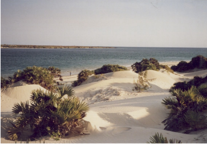
8. Shela sand dunes and beach, view on Manda Island. The Shela sanddunes are the water catchment area on Lamu Island for Lamu Old Town. (See 3.1, 4.1)