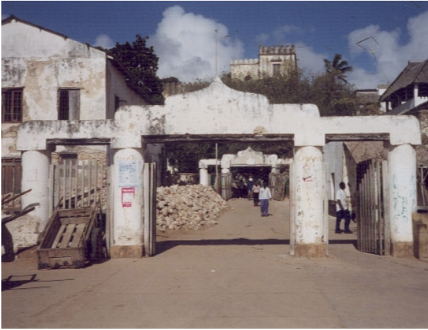
3. The road from the Seafront leading up to the Lamu Fort. The stones on the left are the remains of the Old Custom Office, waiting to be re-used. (see 2.2.1, 3.3)