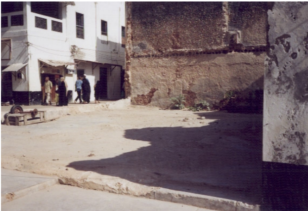
4. The open space where the Old Customs Office, gutted down by fire, stood, in a corner of the Fort's square, is now cleared for rebuilding. (see 2.2.1, 3.3)