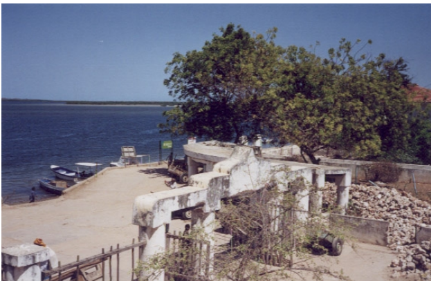
5. View, from the District Commissioners' office, on the seafront and the portal leading up to the Fort. At the right coral stones are waiting to be re-used. (see 2.2.1, 3.3)