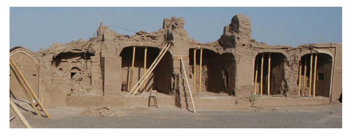
Figure 8. Restoration and conservation- Before revival