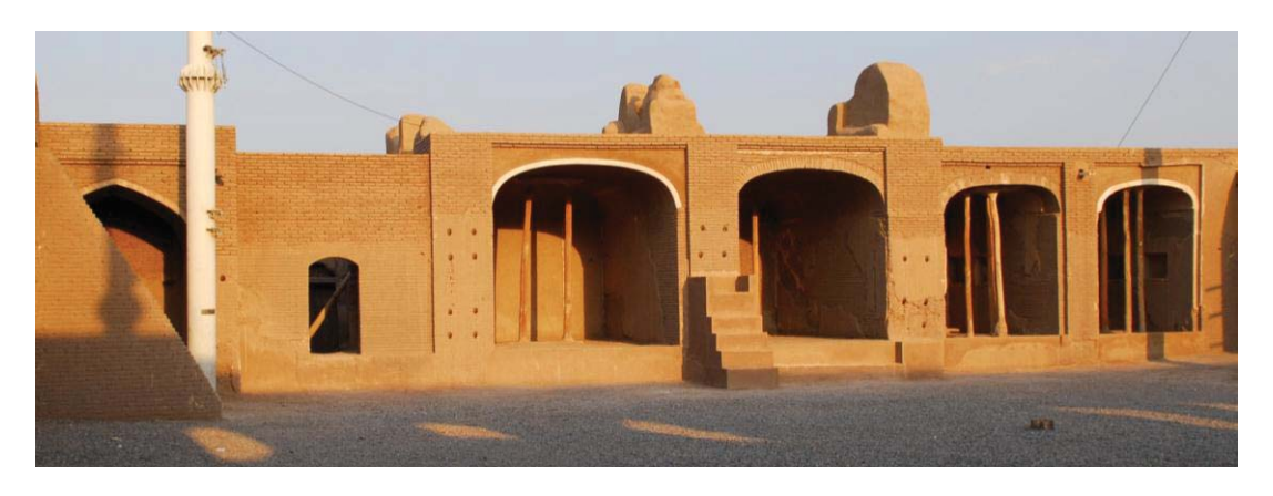
Figure 9. Restoration and conservation- After revival