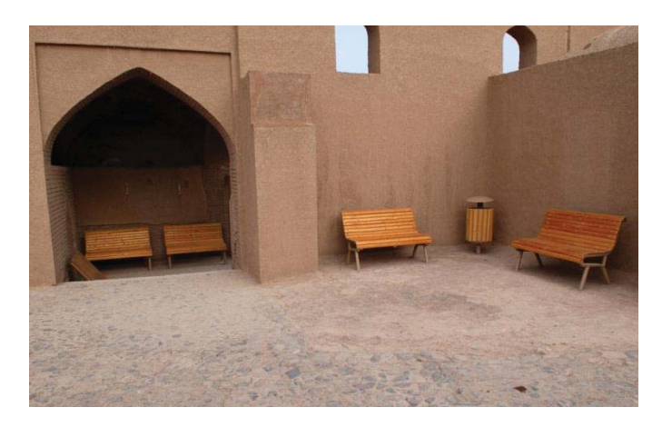
Figure 11. Reorganizing the furnitures