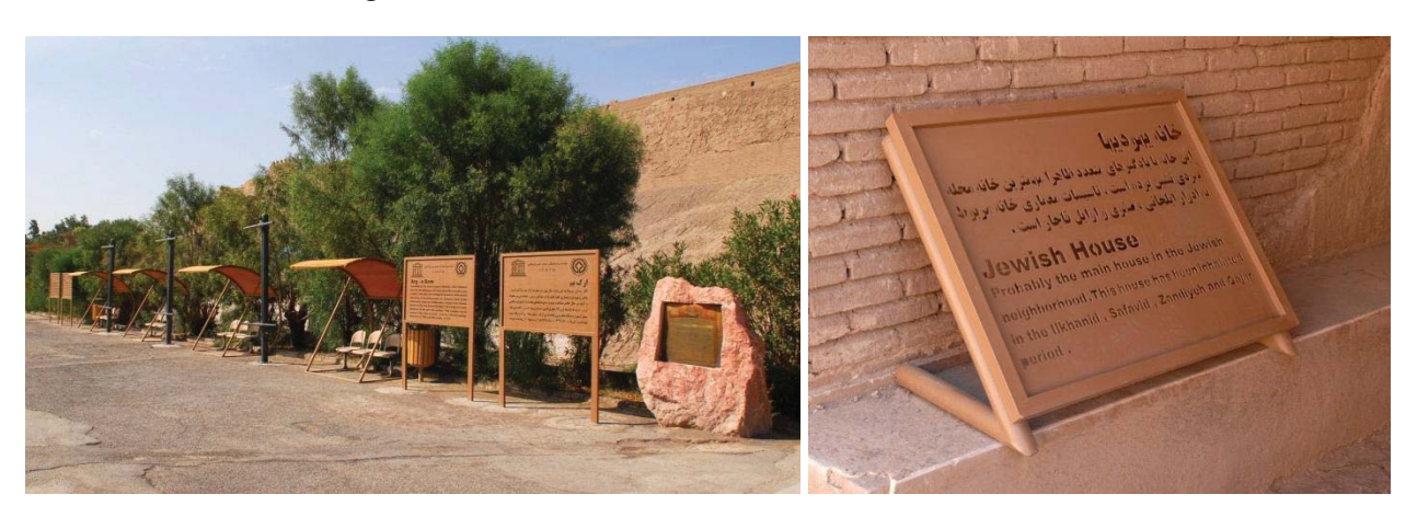
Figure 3. Installation of signs

- Installation of Signs and introduction facilities