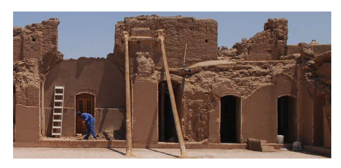
Figure 6. Restoration and conservation- Before outlining the main structure