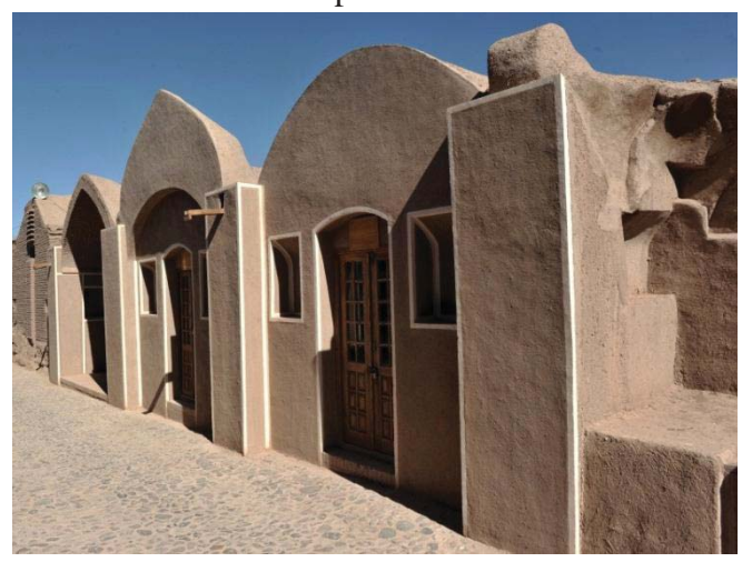
Figure 10. Rehabilitation of restored structures

- Assigning the restored areas of Citadel to artists and traditional artisans to train traditional arts and handicrafts in order to promote the tourist attractions