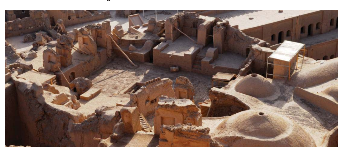
Figure 5. Removal of debris- After