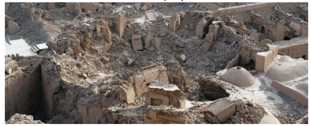
Figure 4. Removal of debris- Before