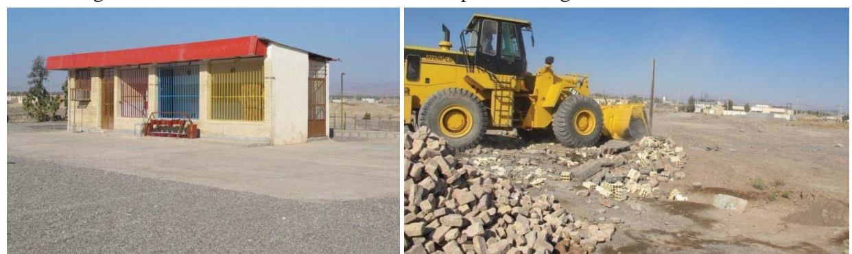
Figure 13. removal of non-adaptive structures

However, ICHHTO and Bam and its Cultural Landscape base would like to ensure permanent monitoring of the buffer zone and sustain efforts to prevent illegal constructions.