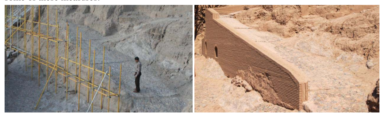
Figure 12. Reorganizing tour paths

Within a span after earthquake, damages caused by the earthquake had disrupted all the visiting paths. The pressure caused by visiting groups could damage the remains. So, a safe and flexible wooden path had been set up. It then accompanied with multi-lingual signs and designed furniture for more efficient and more attractive tours whether for national or international tourists and visitors. Establishment of introduction and handicraft exhibitions, rehabilitating historic structures to be used as recreational and resorts and employing tour guides within the site are some of these measures.