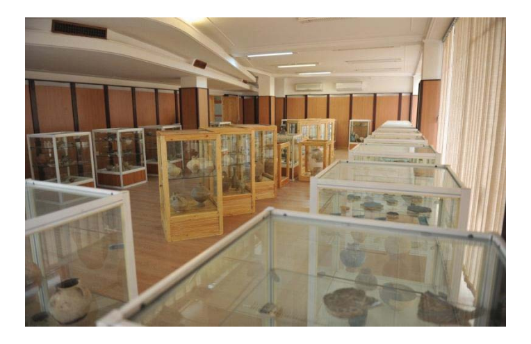
Figure 2. Archeological and anthropological exhibitions

- Development of archeological and anthropological exhibitions