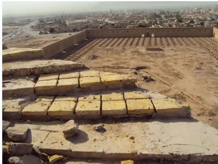
Fig. 2 General view for great mosque courtyard

Many significant changes have been made to this monument using intrusive methods and incompatible materials. The traces of the 1980s reconstruction project are still evident .