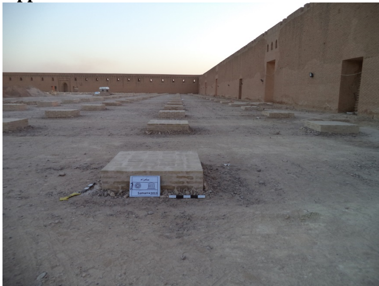
Fig.5 New restored stands inside great mosque courtyard

new stands with its original measure (1,45 X1,45 cms) and to keep the concrete columns inside the new restored stands, in this case the additive column will disappear for ever.