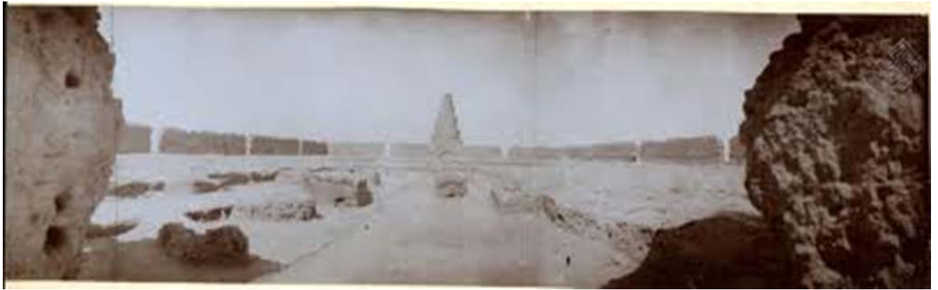
Fig.6 Old stands of great mosque courtyard , German excavation,1911 ,it parallel with new stands

After we complete restoration of new stands we are going to restore the floor of the courtyard after we distinguished some part of the original floor and it became very easy to complete it with the same traditional material with the same measures