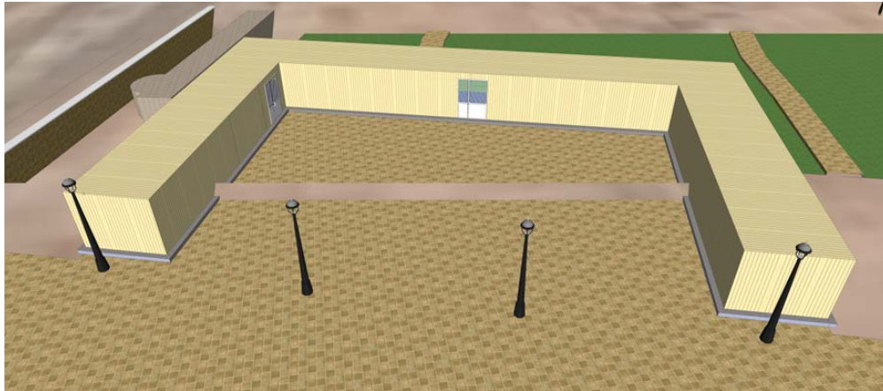
Fig.11, A proposed site unit building in the site

In our world in front of pressure of tourism so world heritage site face many challenges relating managing ,protection and conservation.