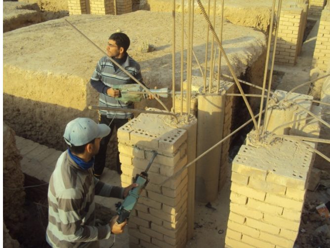
Fig.4 The act of removing concrete columns –last season.