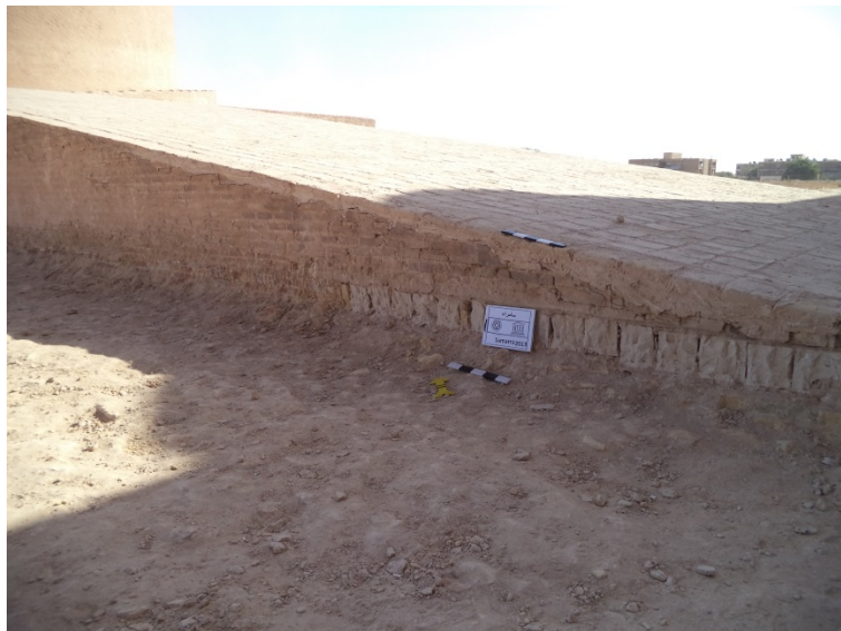
Fig.9 From un inaccurate restoration using stone limestone beneath the ramp

in its upper part the last cylinder in the body ending in the apex of minaret of (3m) in diameter, while the wonderful thing about the upper part of minaret is a group of Mihrab niches, eight in number, crowning the body and their vaults are resting on baked brick semi-cylindrical fused pillars, this minaret's height is about (50m), except the base.