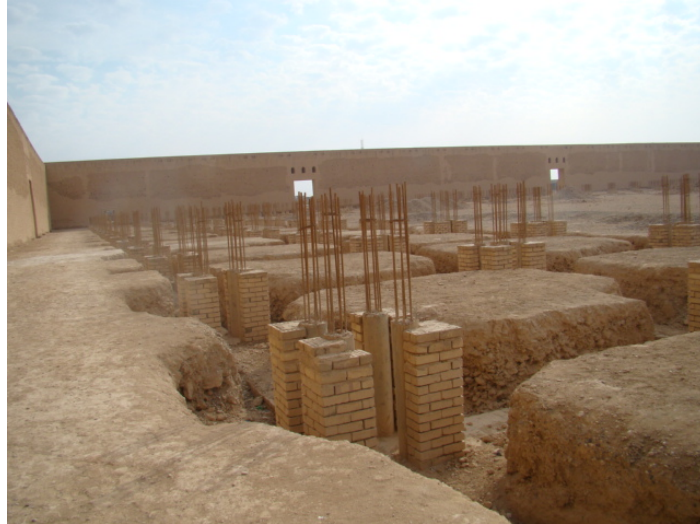
Fig. 3 Some of reinforced concrete foundation and column inside mosques courtyard

The ambitious project for the revitalization of the historical city of Samarra , ordered by the Iraqi government, was carried out by the (SBAH) mostly between 1982-1991 and all these works concluded in 2001-2002 and stopped after US threatens to Iraq.