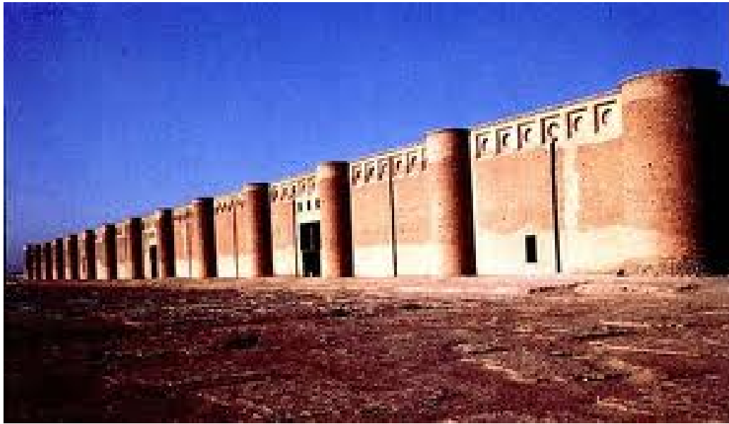
Fig. 1 Great Mosque with its height

The fabric of the mosque has survived exceptionally well, especially considering its bricks and decoration, the heavy-sometimes insensitive –uses to which it has been put over the centuries and its location in a congested part of Samarra.