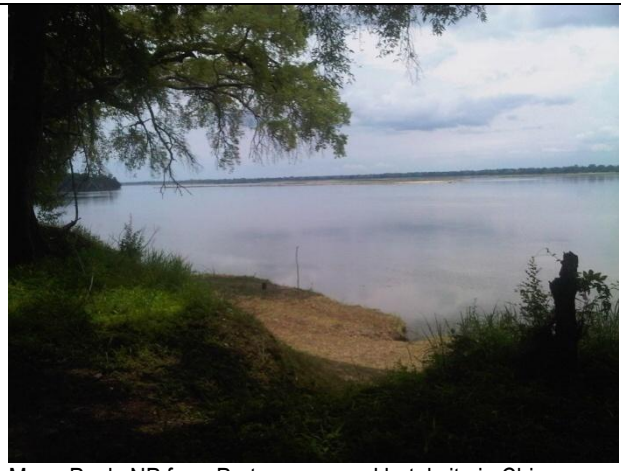
Mana Pools NP from Protea proposed hotel site in Chiawa GMA