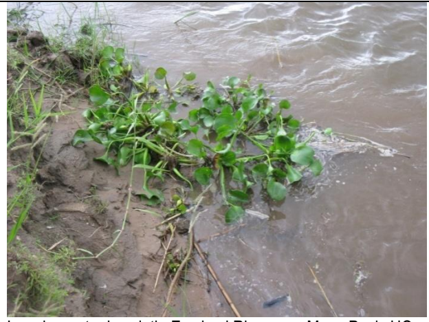
Invasive water hyacinth, Zambezi River near Mana Pools HQ