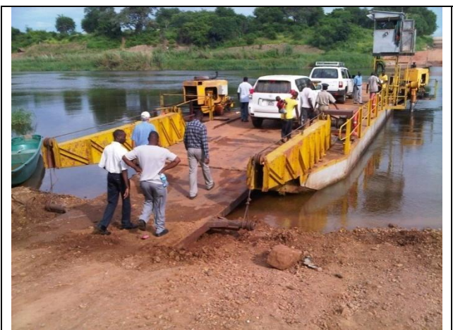
Pontoon to cross the Kafue River to enter Chiawa GMA