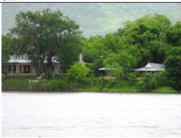
Visual Impact of a recent development in Chief Chiawa GMA seen from the Zambezi River