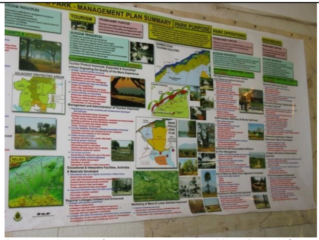
Poster outlining draft management plan at Mana Pools HQ