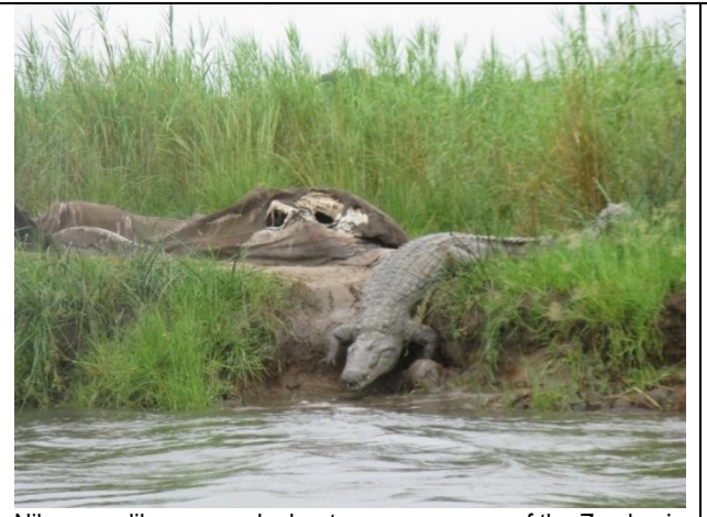
Nile crocodiles on an elephant carcass on one of the Zambezi islands near Mana Pools HQ