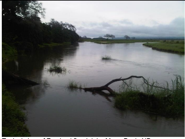
Typical view of Zambezi floodplain, Mana Pools NP