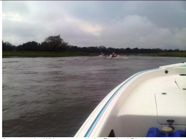
Access to the WH property via the Zambezi River