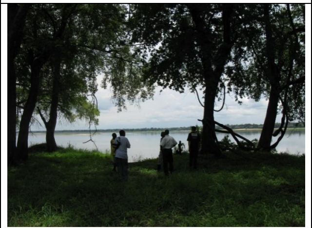
Field visit to the planned Protea Hotel site, Chiawa GMA