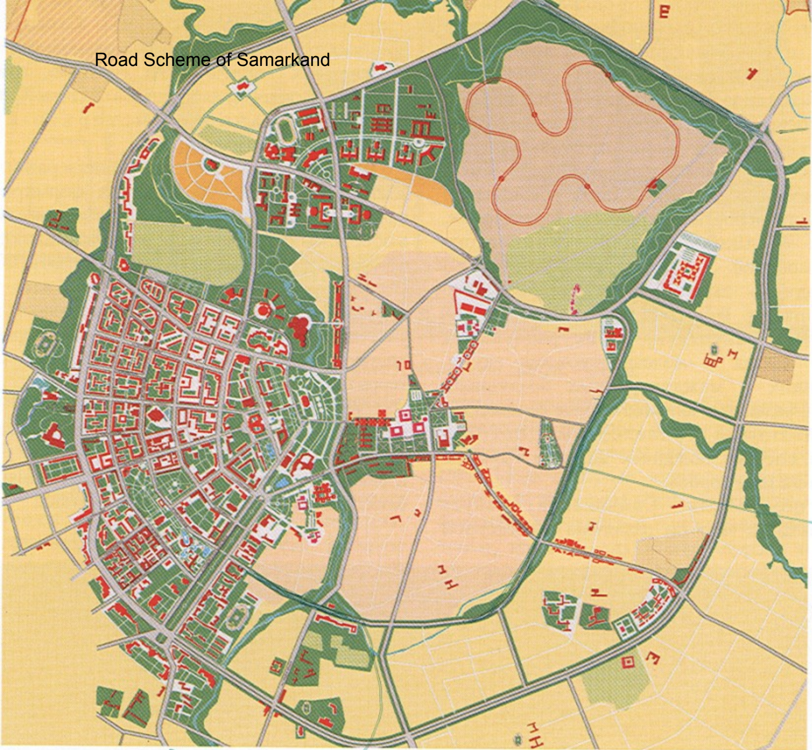
Road Scheme of Samarkand