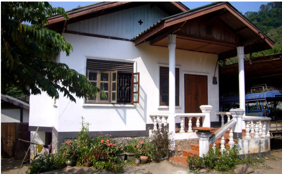
Photo 6. New house in Chompeth fails to respect heritage requirements.