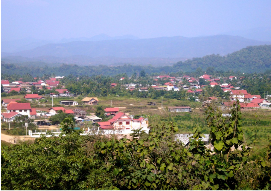
Photo 13. Suburban sprawl on the agricultural lands south of the historic centre.