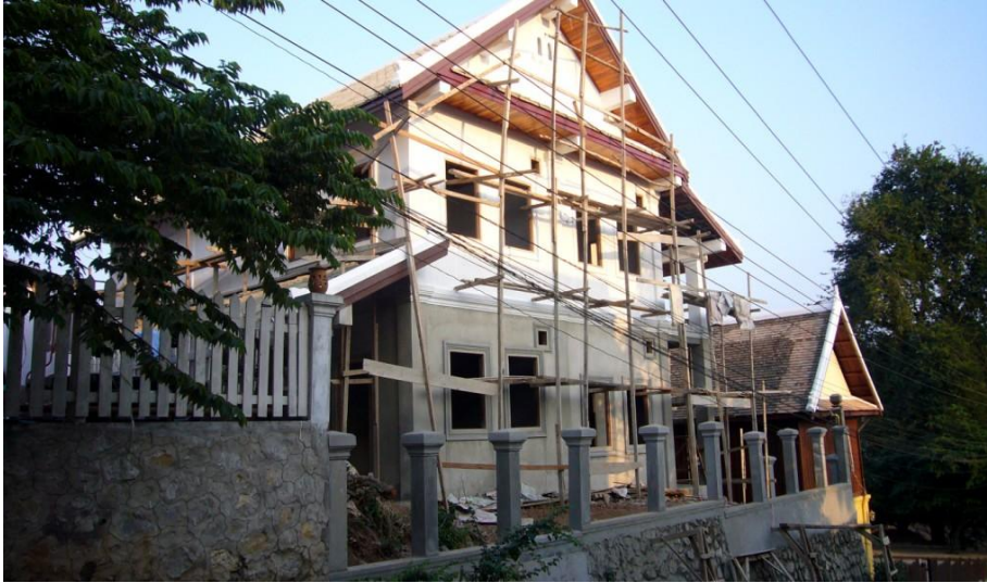
Photo 9. Large house under construction in central town fails to respect plot ratio regulations.