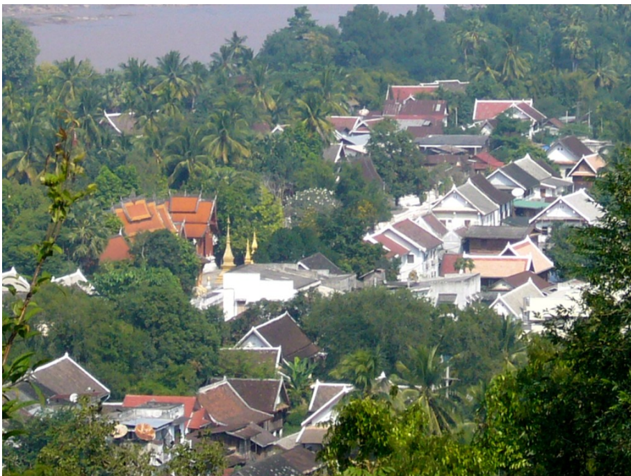
Photo 8. Densification and loss of vegetation cover in a central town precinct.