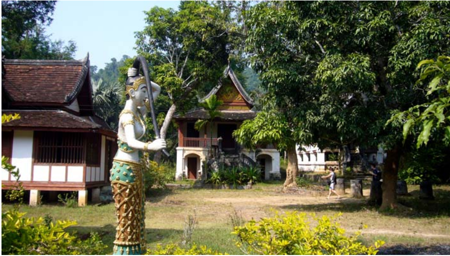
Photo 15. Deserted Wat Long Khun compound, Chompeth district.