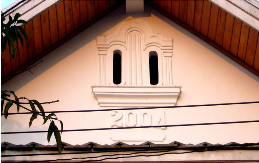
Photo 7. New house, historical detailing.