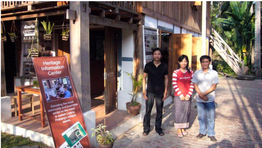
Photo 4. MDP's Heritage Information Centre and staff.