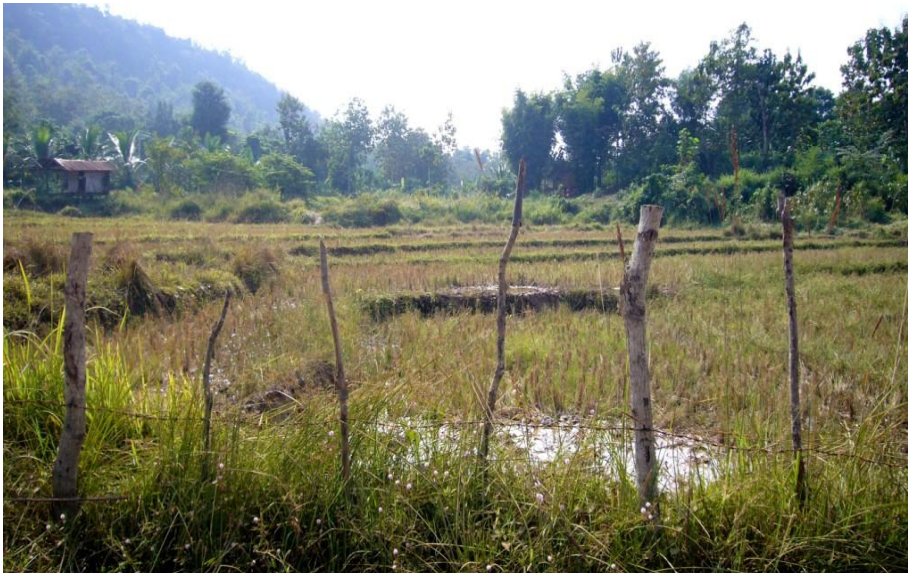
Photo 1. Chompeth valley, site of proposed Chinese-funded new town.