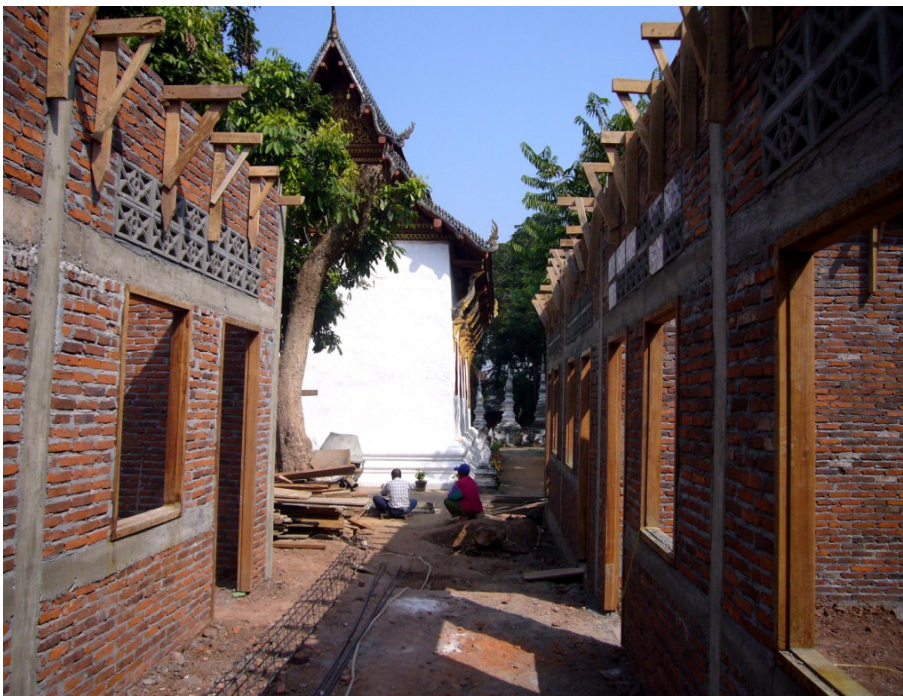
Photo 10. Construction of new dormitory blocks leading to the densification of a wat compound.