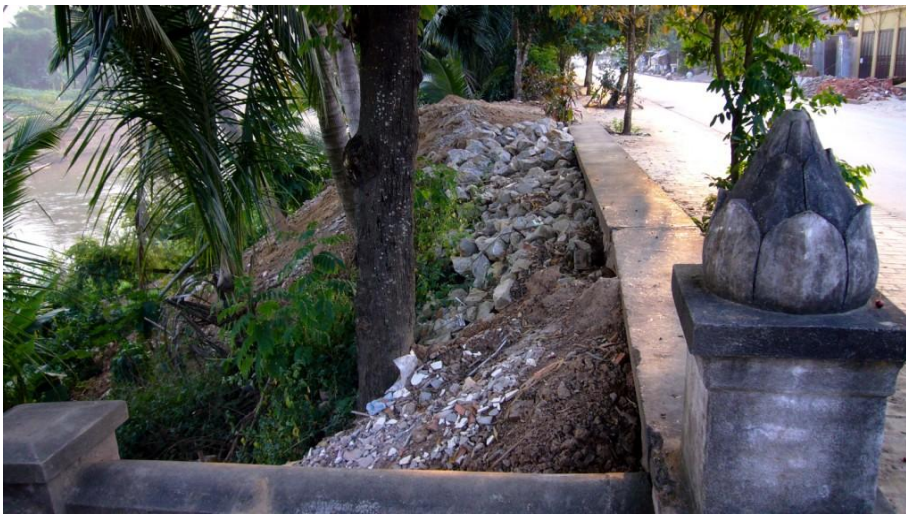
Photo 12. Illegal dumping of building site waste onto the Nam Khan river bank.