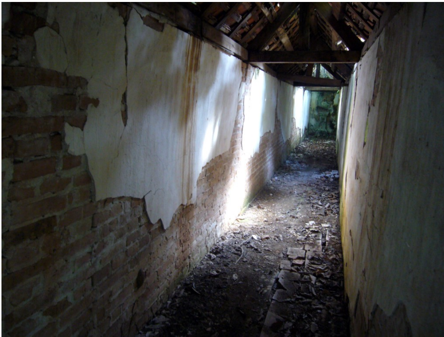
Photo 16. Derelict prayer hall, Chompeth district.