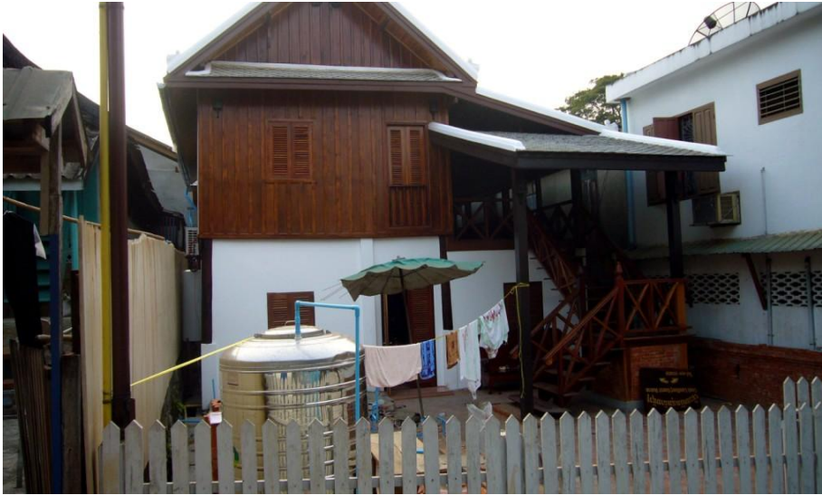
Photo 5. New house in central town shows some respect for Lao form but little for setback, design and materials regulations.