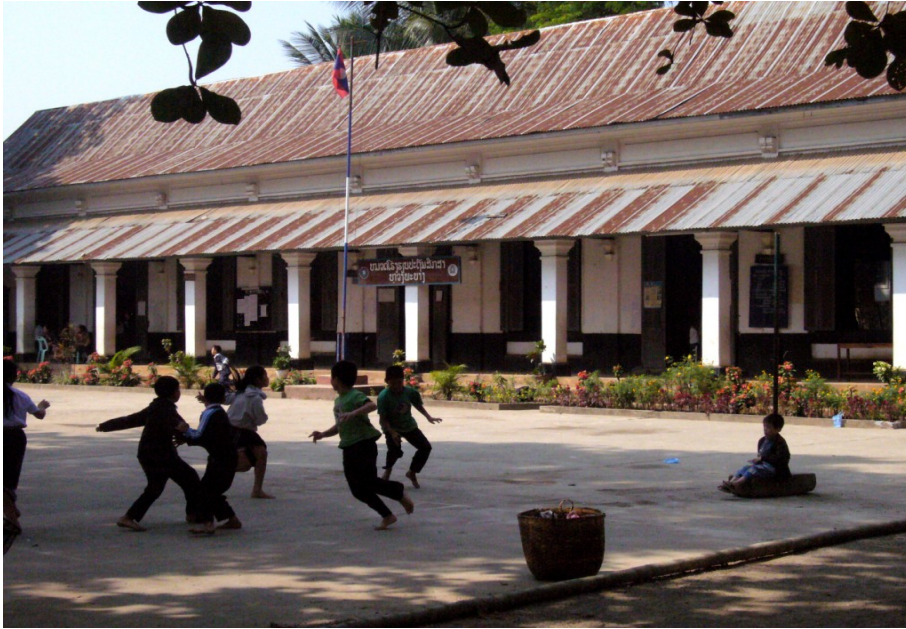
Photo 3. Primary school, an important social asset and open space.