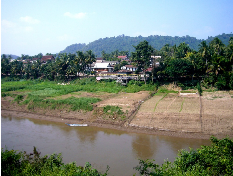
Photo 11. Incursion of constructions onto the Nam Khan river banks.