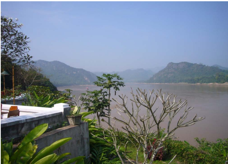
Photo 2. Mekong vista downstream from Grand Luang Prabang Hotel.