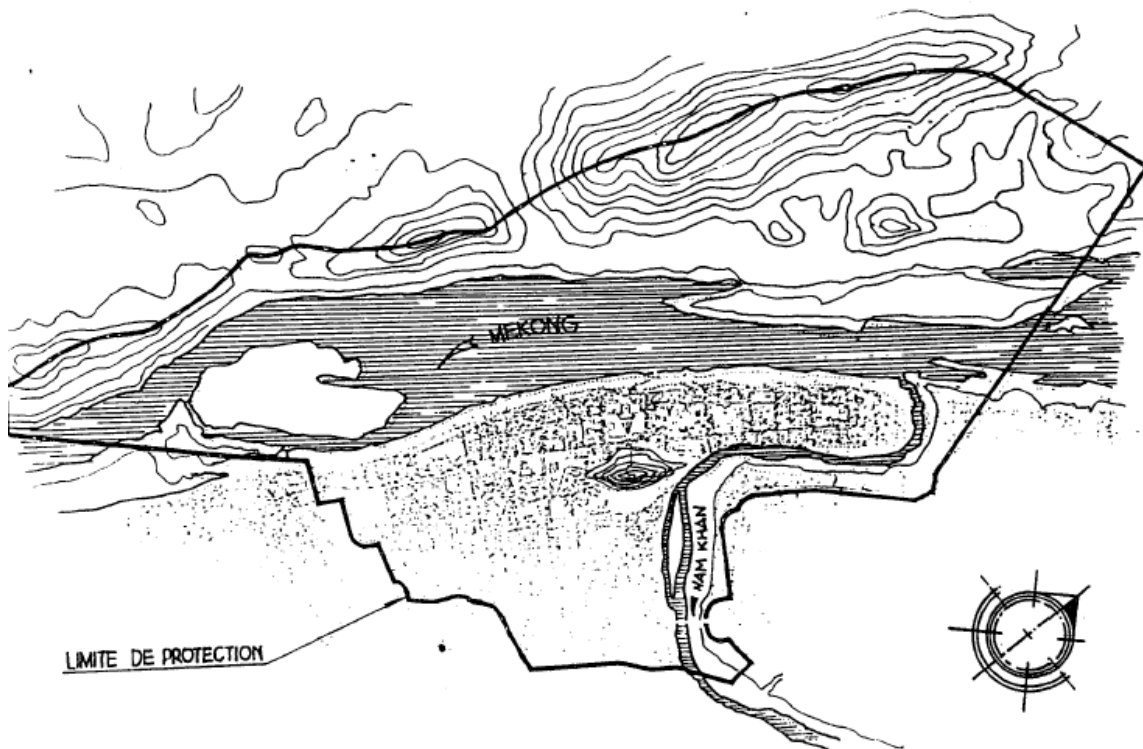
Fig. 1. The Heritage Protection Zone according to the 1994 Decree. This is the area actually inscribed on the World Heritage List. No buffer zone was provided.

At the time of inscription, the conservation and management framework for the World Heritage property of Luang Prabang was based on a decree issued in 1994, establishing a Heritage Protection Zone (ZPP), under the responsibility of the Ministry of Information and Culture and the local authorities. Religious buildings were protected under a 1978 Law and responsibility for their upkeep was entrusted to the Lao Buddhist Federation (LBF). The area currently inscribed on the World Heritage List corresponds to the Heritage Protected Zone established under the 1994 Decree.