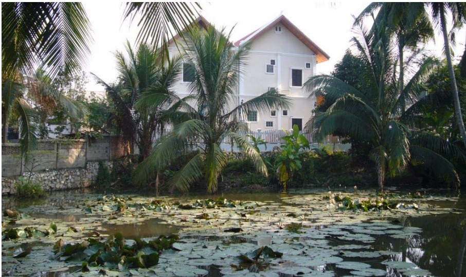
Photo 14. New multi-storeyed guesthouse recently constructed on a filled-in Wetlands pond.