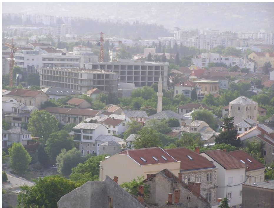
2. Photo of the present concrete structure, 2006