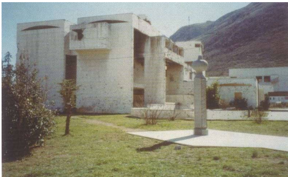
1. Photo of Mr. Ugljen hotel from UNESCO 's publication " Urban Heritage Map of Mostar" - 1997